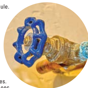
LEAD AND COPPER SAMPLING AT HIGH-RISK RESIDENTIAL WATER TAPS*

In 2021, the EPA revised the lead and copper rule to enhance the original 1991 rule. An additional measure that has been identified to help reduce lead in drinking water is the identification and removal of lead service lines. The use of lead service lines was banned in 1986 and predominately phased out of use much earlier than that. Lead service lines have been determined to have a large impact on lead in drinking water. The majority of service lines are shared between the customer and the City. Where most service lines on the city-owned portion have been identified, there is little known about the customer-owned portion (from the meter to the house). If your residence was built prior to 1986 and you would like to help SLC Public Utilities identify the material of your service line please complete the form at https://www.slc.gov/utilities/leadandcoppersurvey or email inquiries to lead@slc.gov . For more information including how to reduce exposure to lead and copper in drinking water, visit www.slc.gov/utilities/leadandcopper .