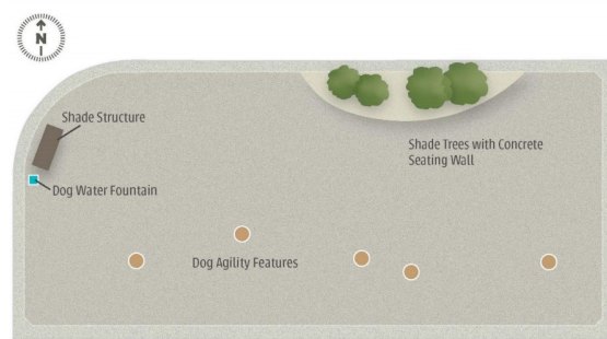
Herman Franks Dog Park

Workers have also poured concrete for a new shade tree and seating wall area, which will be finished in the spring. The project is now paused for the winter.