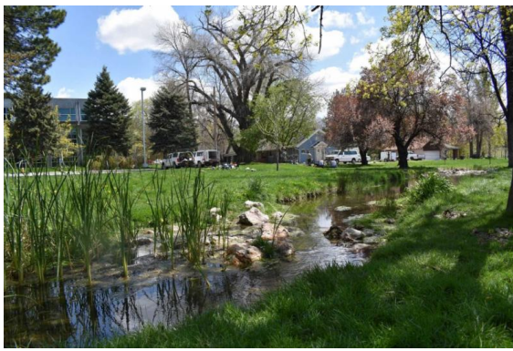
Photo: Existing Fairmont Park Stream