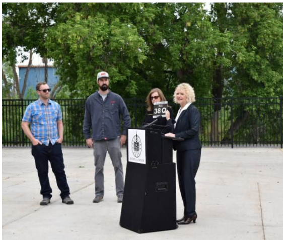
Mayor Biskupski presenting the first emergency marker sign.

South and the Davis County line. The installation process will take approximately one month to complete. (Photo: Lewis Kogan describing the new emergency marker sign system.)