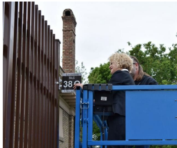
Mayor Biskupski hanging the first emergency marker sign on the Jordan River Parkway Trail.