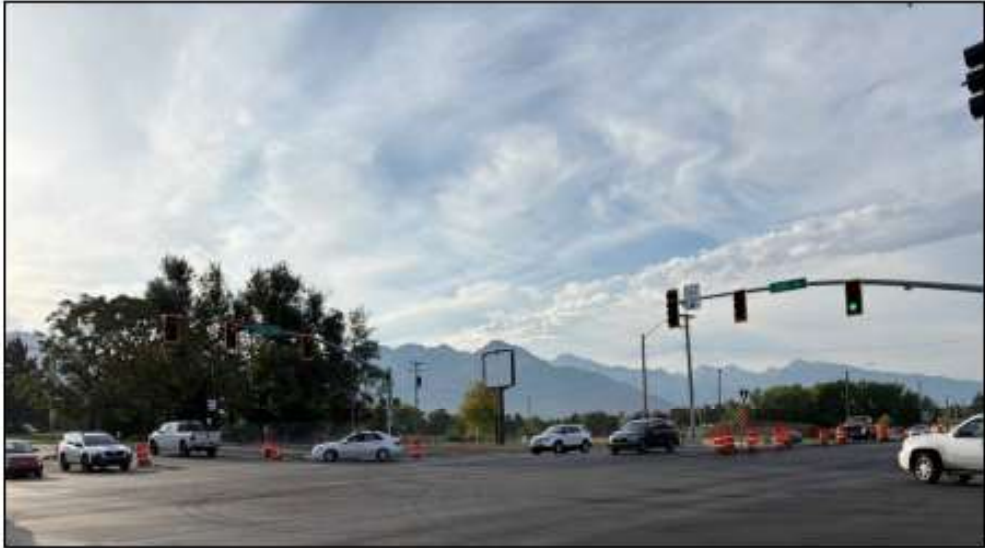
Former Sizzler restaurant sign is approximately 20 feet tall. Buildings up to 40 feet would be allowed under current zoning.

zoning currently allows buildings up to 40 feet tall which will block views to the east. The following image from the Planning Commission staff report shows the former Sizzler restaurant sign which is approximately 20 feet tall. A building twice this height would be allowed in the current zone.