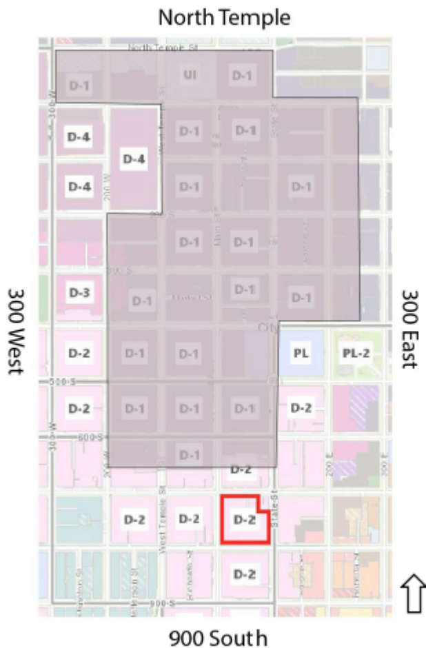
Area zoning map with subject property outlined in red.