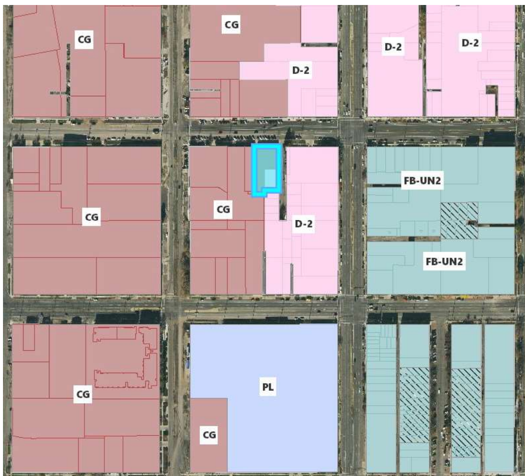
Area zoning map with subject parcel highlighted in blue.

As shown in the map below, area zoning is primarily D-2 fronting the west side of 300 West, Kilby Court, and portions of 700 South. CG zoning is found on 700 South west of the subject property. FB-UN2 (Form Based Urban Neighborhood) is to the south and east of the property. The Fleet Block is located on the block to the south.