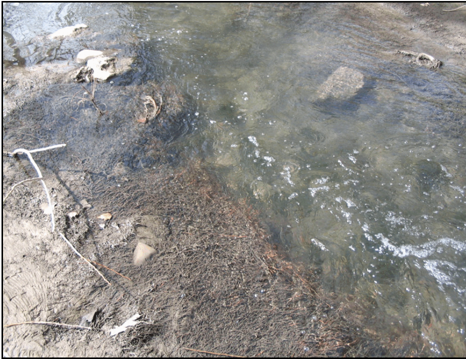
Figure 2.2. Clay/root mat “shelf” feature.

point feature using a GPS device and data logger, and photographs of the GPS points were taken for reference. Notes were also created and stored with each GPS point. Spatial accuracy of the GPS data was somewhat limited due to tree canopy and steep bank conditions; it was typically approximately 10 meters.