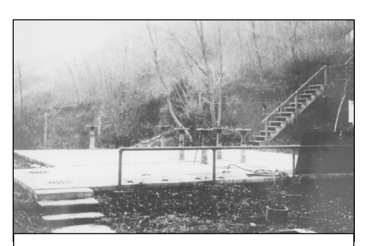
New High Line Intake and 50,000 gallon tank at elevation 5300-ft. The facility was removed in 1953 when the water treatment plant was constructed. Circa 1910.

Wards until 1862 when the United States Government established Fort Douglas. The Army then appropriated the water for its use,