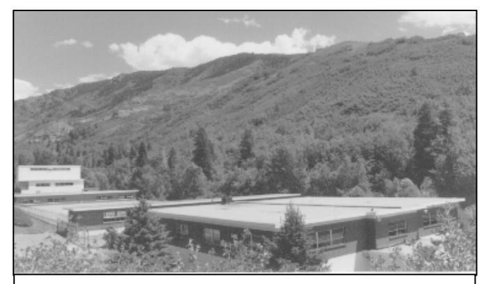
City Creek Water Treatment Plant located about 3 miles above Bonneville Loop Road. Circa 1985

Pollution levels in City Creek, as measured by Coliform bacteria were considered low, and with the introduction of chlorine as a disinfectant, the water met drinking water standards of that time. However by 1950, the Coliform bacteria counts began to dramatically increase from an annual average of