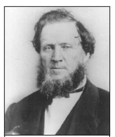
Brigham Young empowered the High Council to appropriate City Creek water.

inheritance of land which was given free of charge, save a surveyor's fee. Water to irrigate the land was diverted from City Creek and was appropriated and controlled first by the secular High Council, then the Church Ward Bishops, and finally by the elected City Council.