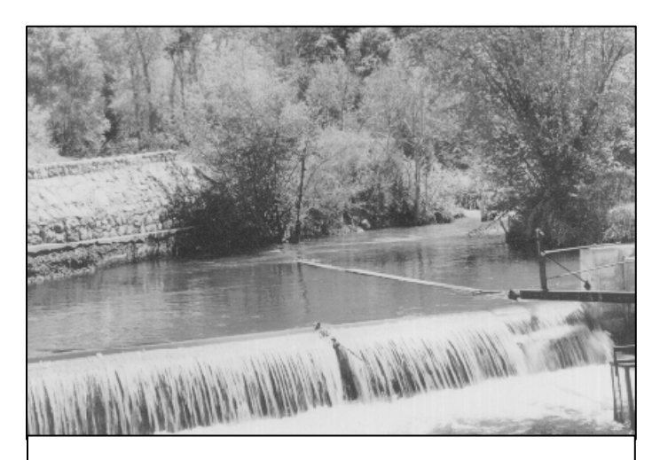
Old High Line Intake (Capitol Intake) above Pleasant Valley Reservoir at the 5058-ft. elevation. Abandoned in 1953 when the water treatment plant was built.

By June 22, 1877 the last of the main pipe purchased for the waterworks was laid. Superintendent