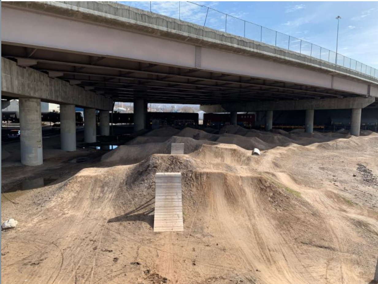
Photo of the 9-Line Bike Park located at 905 South 700 West, Salt Lake City, Utah. March 12, 2019

Parks, Natural Lands, Urban Forestry, and Trails