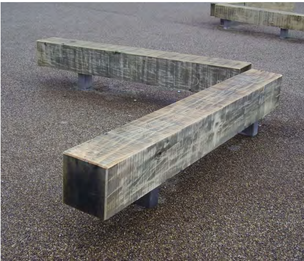
Railroad Ties: Bench