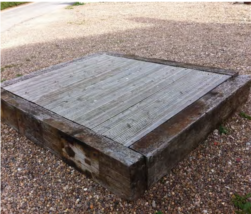
Railroad Ties: Platform