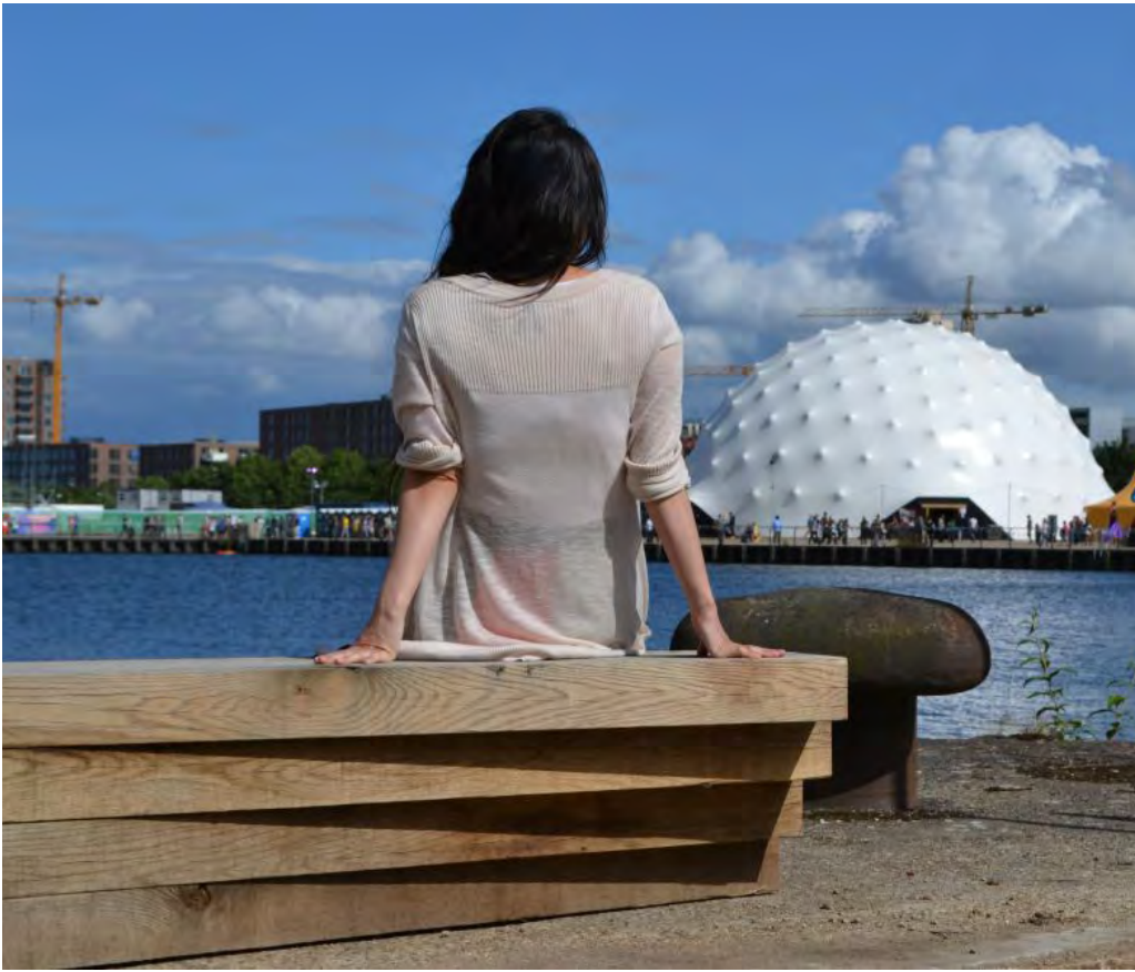
Railroad Ties: Bench