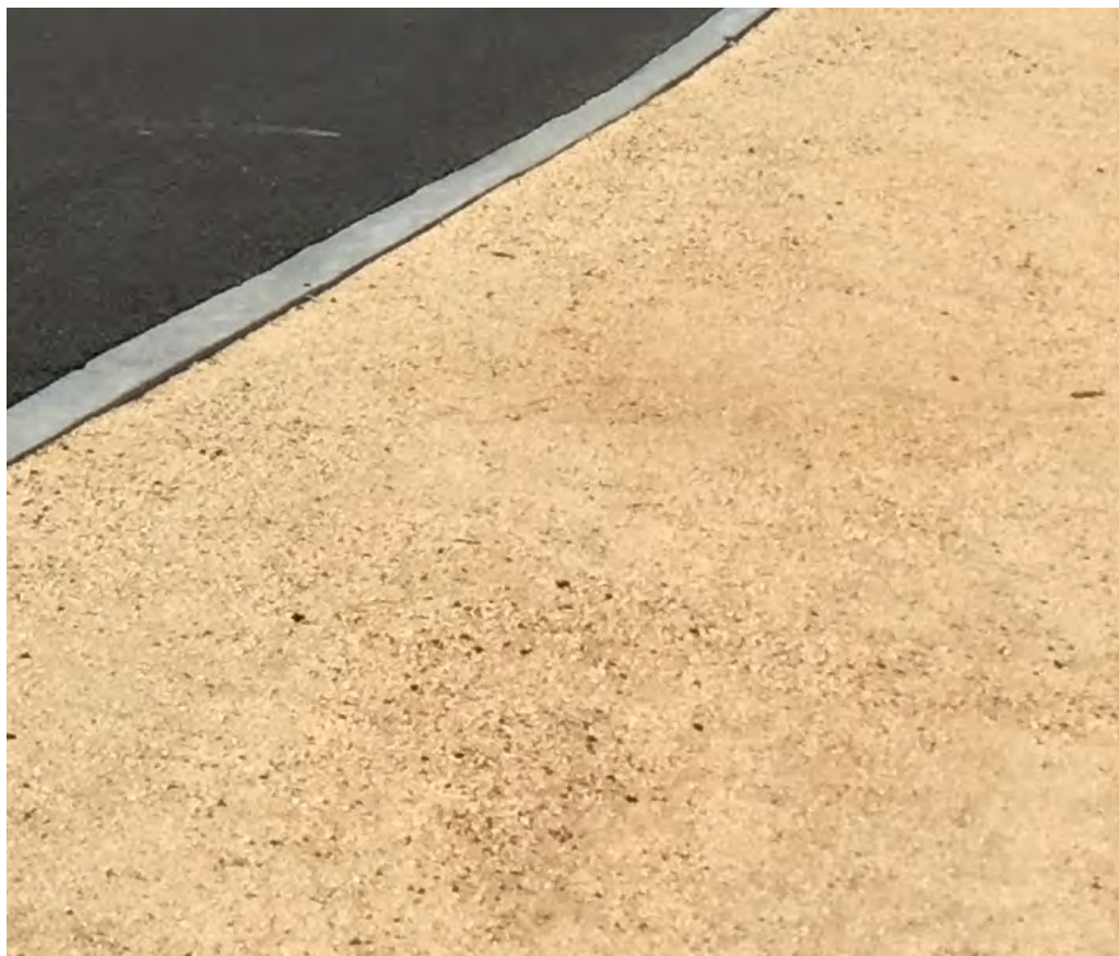
Crushed Stone Pavement