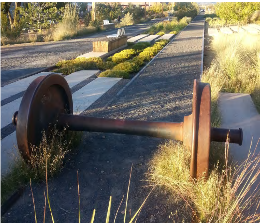
Historic Train Relics