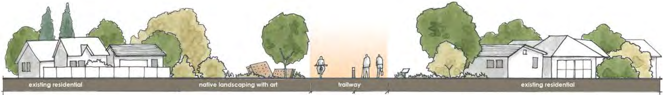
CORRIDOR TYPE B

The surrounding context of this railway is established residential neighborhoods. With limited right of way width, this section will primarily function as a connecting link between nearby nodes. Plantings and vegetation will reflect the residential nature through inclusion of shade trees interspersed with low native plants. The focus of this corridor type is to