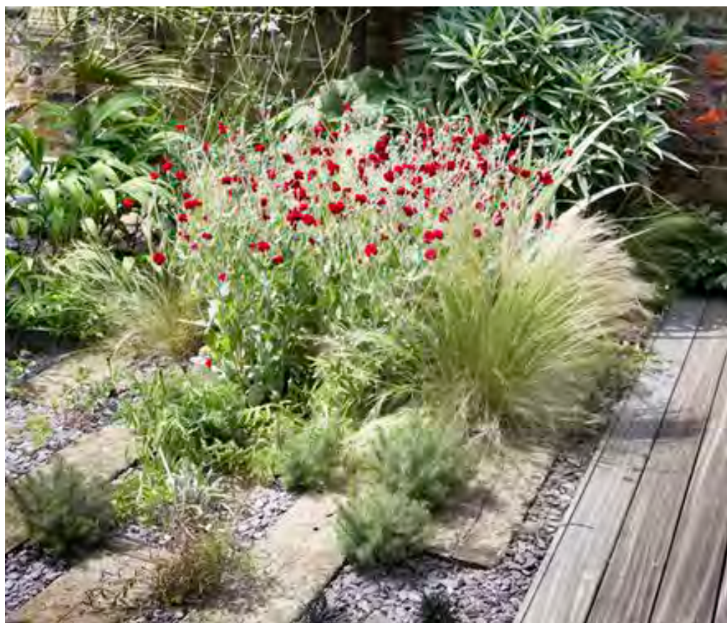
Native Plants/Railroad Ties