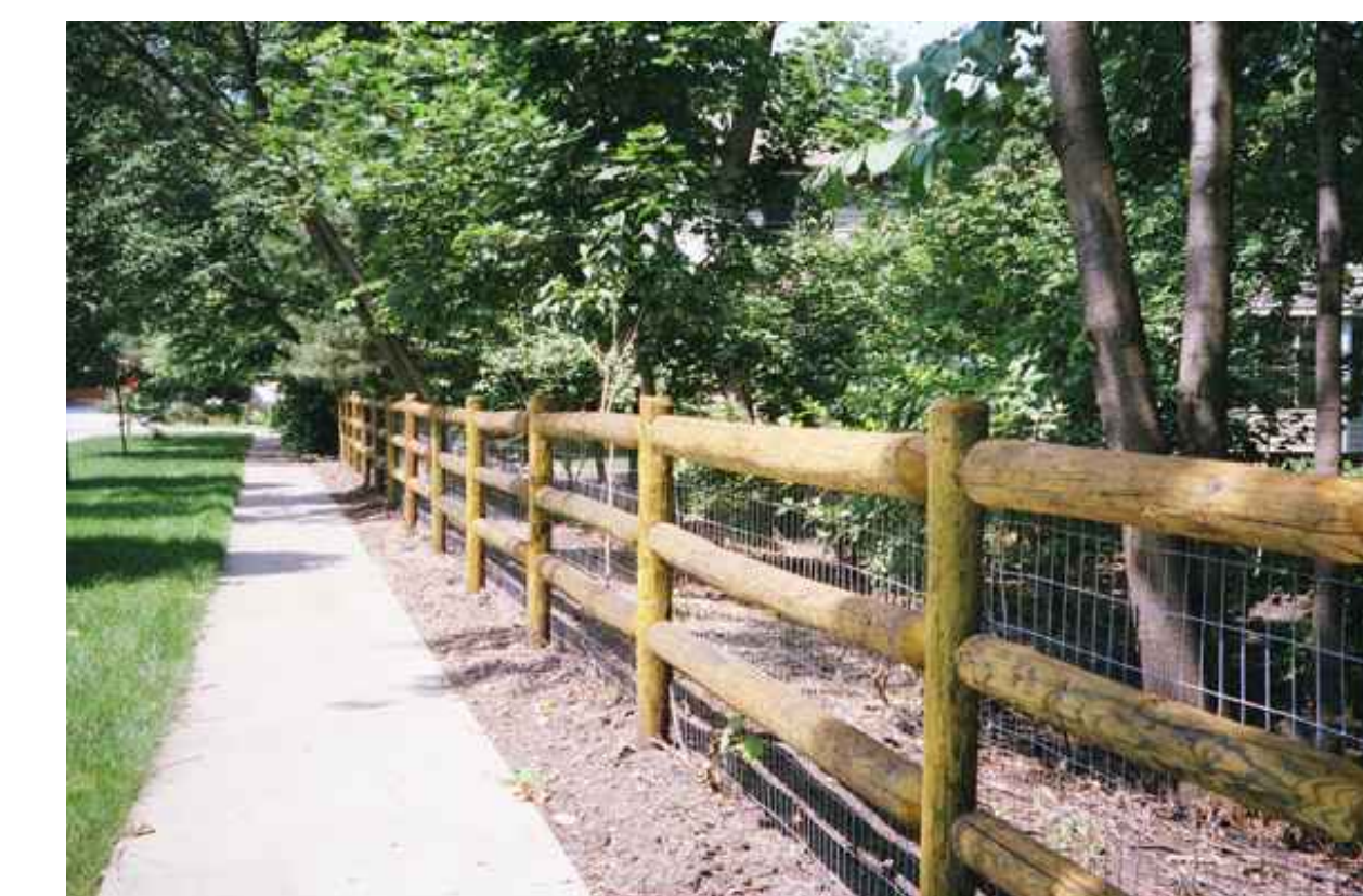
POST & RAIL FENCE