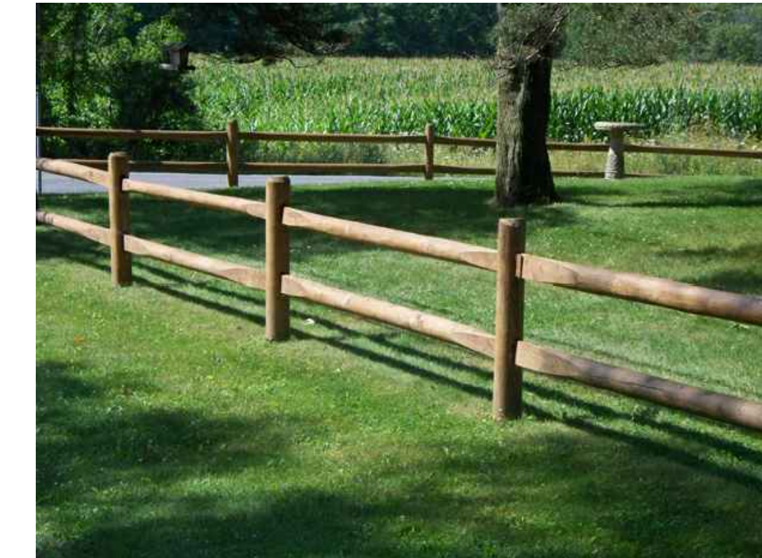
SPLIT RAIL FENCE