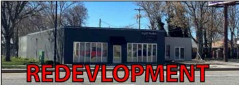
Subject site - existing building