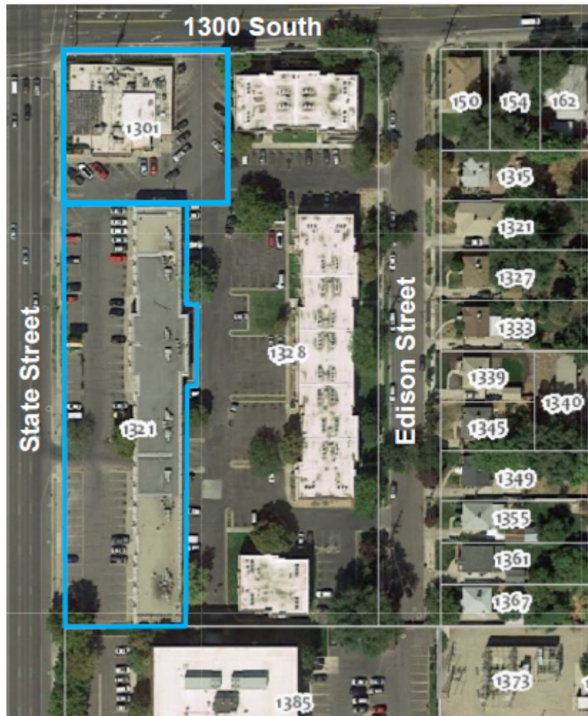
Aerial image showing the subject parcels outlined in blue.

Goal of the briefing: Review the proposed zoning map and master plan amendments, determine if the Council supports moving forward with the proposal.