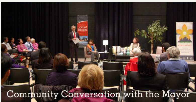
Community Conversation with the Mayor