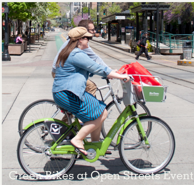
Green Bikes at Open Streets Event