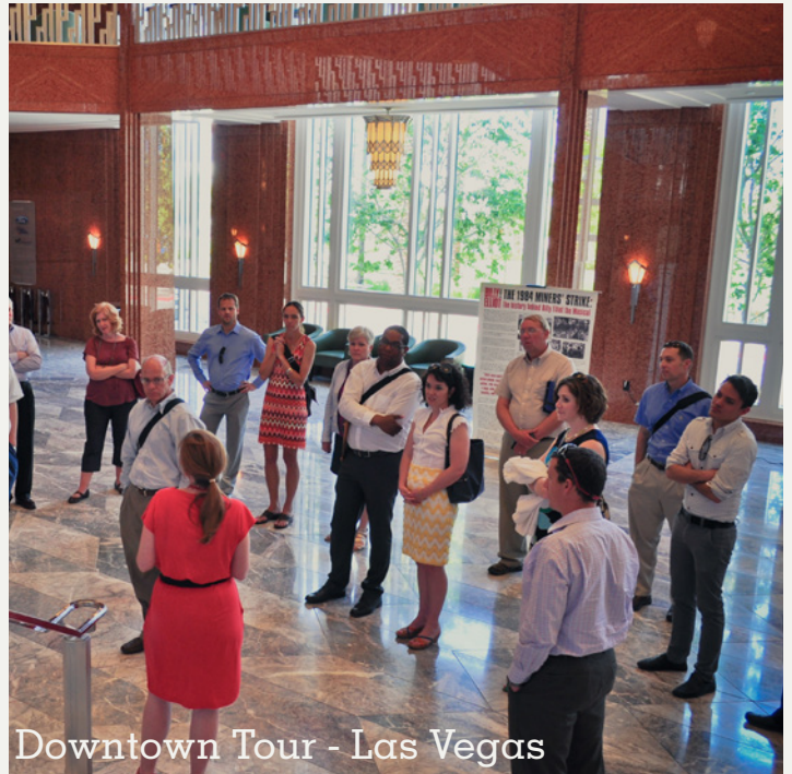
Downtown Tour - Las Vegas