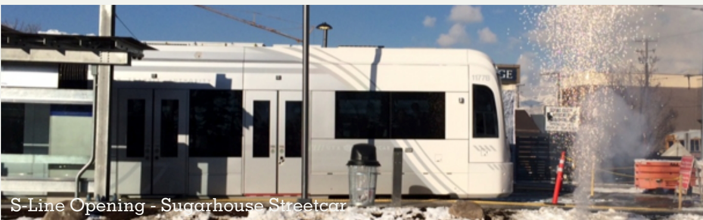
S-Line Opening - Sugarhouse Streetcar