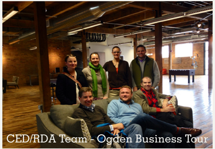
CED/RDA Team - Ogden Business Tour

A special thank you to Mayor Ralph Becker and the Salt Lake City Council for their funding support and policy direction