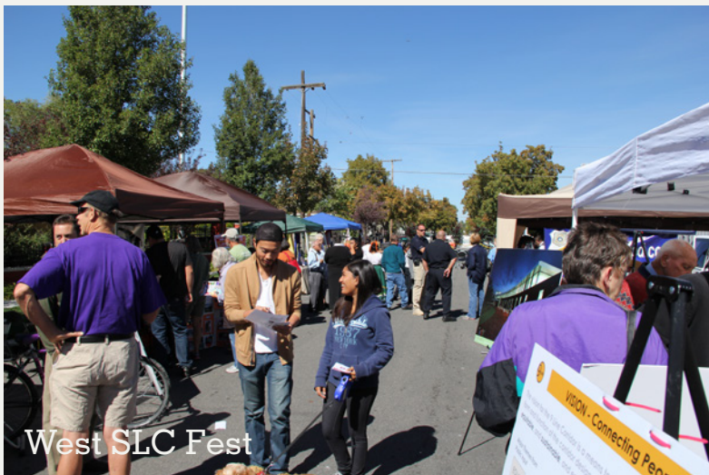
West SLC Fest