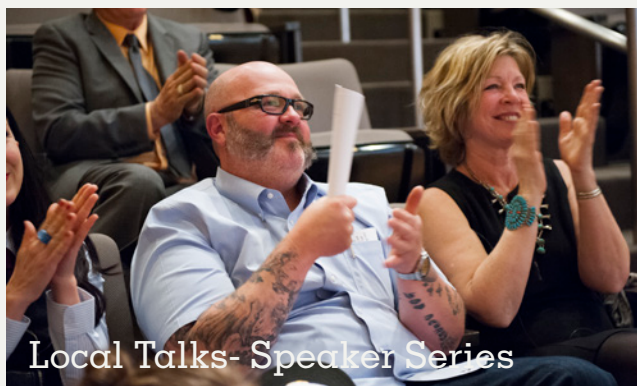
Local Talks- Speaker Series