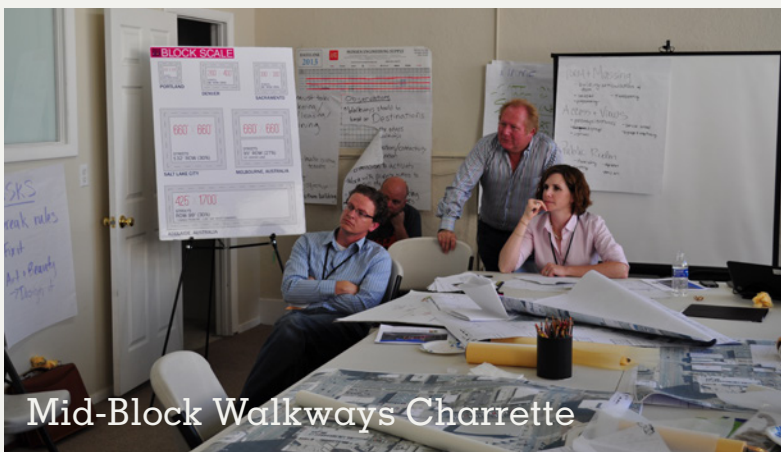
Mid-Block Walkways Charrette