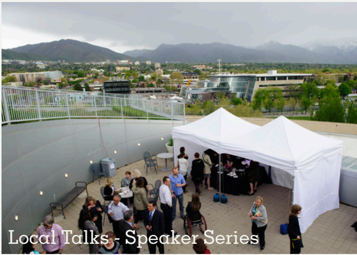
Local Talks - Speaker Series