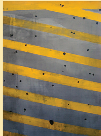
Layne Meacham, Gold's Gym on Van Winkle, Salt Lake City, Utah 72" x 84", mixed media on canvas, 2011

depicts black polka dots of old chewed gum and brightly colored spray painted symbols of city street departments, or the “dirty things” that make up a city landscape, together forming interesting stellar matrixes and sidewalk rock art. Meacham notes, “The gum spots and the Blue Stake marks are an anesthetization of all kinds of markings including graffiti, in our here and now existence, and which regardless of how they affect us one way or another, we can do little to escape them. So we might as well embrace them and be particularly mindful of them and then let our minds do with them as they may.”