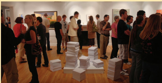
Reception for the 2009 35 x 35 exhibit.

The Artists of Utah 35 x 35 exhibit opens at the Finch Lane Gallery on Friday, March 8 and continues through April 26. The 35 x 35 exhibit is a showcase of art by Utah's younger generation. From an open call to all Utah artists 35 or younger, the Artists of Utah Board of Directors selects 35 artists for the exhibition. In 2009, the exhibit opened to packed audiences at Finch Lane Gallery, and a number of the artists featured in that show have gone on to become major figures in the local art scene. Styles exhibited range from the traditional to the cutting edge, as Artists of Utah strives to present Utah with a snapshot of the best art being made by the state's younger artists.