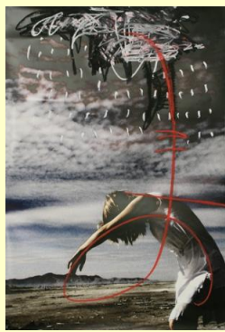
Performance Still #2, digital photography, paint stick, 2013

Somsen's most recent exhibitions include a two person show at Phillips Gallery in 2013 and a 2011 solo show titled, Grafted . She has worked as an instructor at the Visual Art Institute for 15