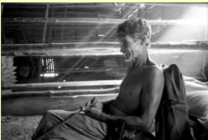
Vinales, Cuba, silver gelatin photography 2012

Carl Oelerich presents his photographs from a decade-long project documenting the guajiros of western Cuba. Guajiros are the peasant farmers who are the agricultural backbone of Cuba in the economically-challenged countryside; they farm by hand, without use of machinery. The photographs depict the resilient, and proud guajiros , the challenges under which they work in tobacco fields, to the simple wood houses in which they live.