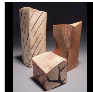
Crooked Lines , ceramic, 2013

Aaron Ashcraft began a new series of work in 2011. He started drawing on flat slabs of soft clay with a variety of tools, including textures found in nature. Three dimensional works quickly followed the slab pieces and stiff, angular forms began to turn and twist with cutout sections to mimic the human form. Ashcraft comments on this process, "Rapidly moving beyond my established conceptions of what clay can be, my work has entered a realm where surface and sculptural form are the dominant forces."