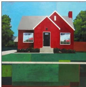
East Side, West Side House , acrylic, 2013