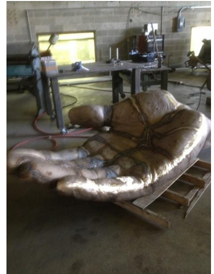
Serve & Protect , bronze, 2013

The four public art projects at the new Public Safety Building will be fully installed in June. Park City artist, Greg Ragland's sculpture, Serve & Protect , which will be installed on the Plaza Garden is a cast bronze sculpture of two open hands side-by-side – a gesture which demonstrates the sign language "to serve." Each hand; approximately 10 feet long, 3 feet high and 4½ feet wide makes a natural seating element and begs investigation by both children and adults. Ragland states "The sculpture glorifies all the emergency service responders. The same graceful hands which serve us are also hands strong enough to protect and care for us. By casting the oversized hands in bronze it reinforces the longevity of the force and acts as a powerful symbol of our confidence in those individuals. Powerful and elegant, the sculpture emerges from the Plaza Garden as a solid reminder that our larger than life heroes will be there to Serve and Protect us all."