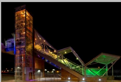
Crystal Light , 2013

Crystal Light is a response to the energy of the people of Salt Lake City using the dramatic weather as metaphor. Crystal Light responds to the shifting lights and colors of the surroundings. The work projects the crystal and water patterns beyond the physical boundaries of the work onto the surrounding surfaces. The sky and clouds become a part of the work as the etched forms are seen against this dramatic backdrop of light and color. At night, the viewer experiences a carefully choreographed lighting program that moves with the escalator and elevator. Widery installed stainless steel discs on the lower and upper platforms and on the stairs. The discs catch and reflect the natural and colored light as the pedestrian walks the stairs from one platform to the other.