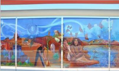
Comunidades en Solidaridad: A Collective Transformative Vision

The strength and internal beauty of SLC is intuitively implied through color, light, movement, gestures, and the content: land, city and people intertwined harmoniously in the three murals' themes - Past, Present, Future in the Arts; Education / Experiential Knowledge; Working Together / Building Utah. ■