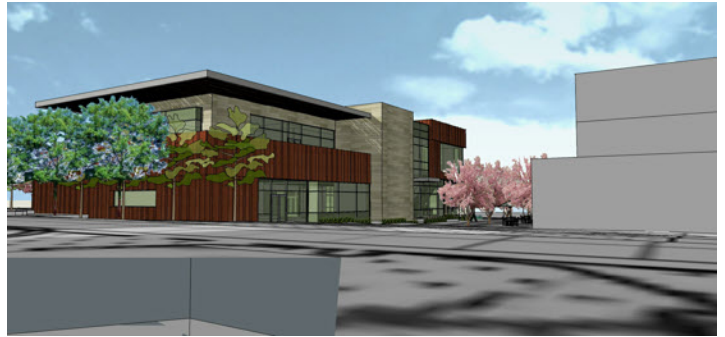
North east perspective