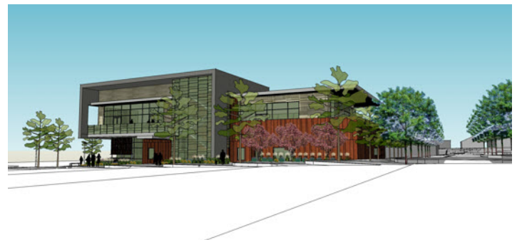
South east perspective