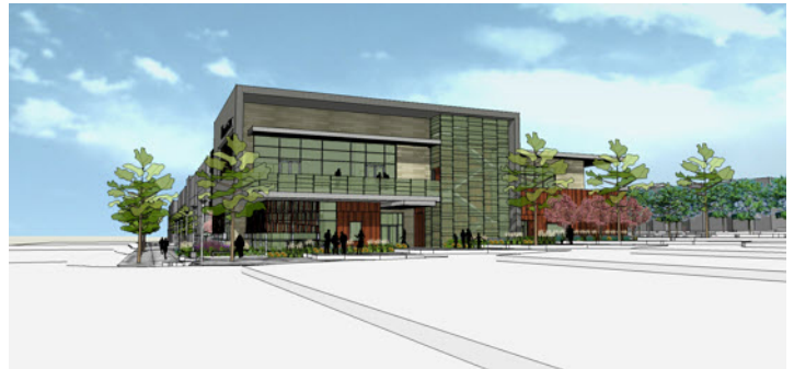
South west perspective