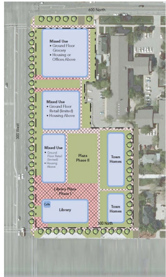
4-acre site (proposed plan)

To receive future public art opportunities please send your email address to: roni.thomas@slcgov.com