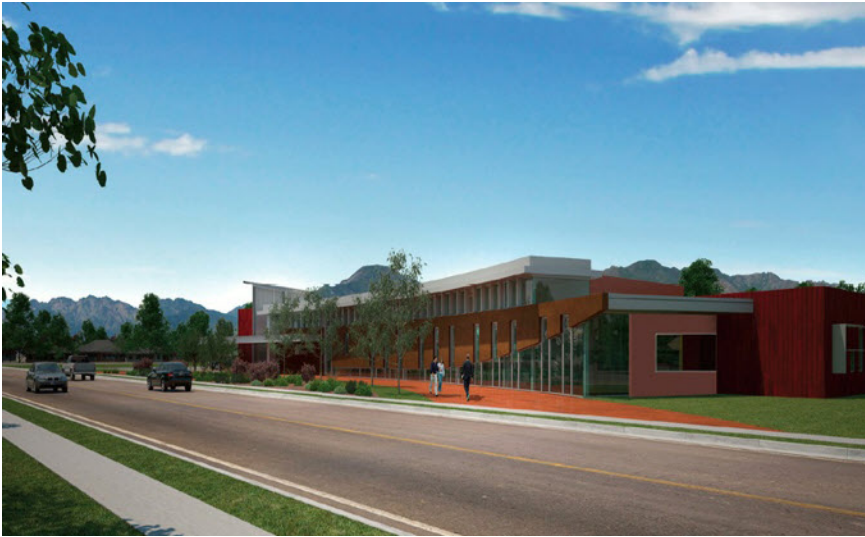
rendering of exterior