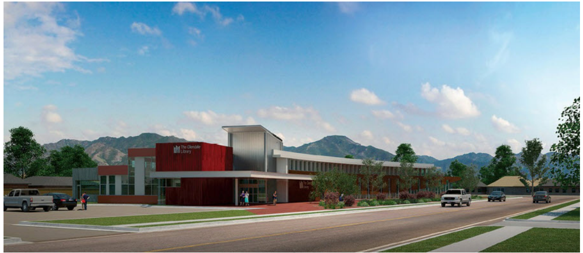
rendering of building front