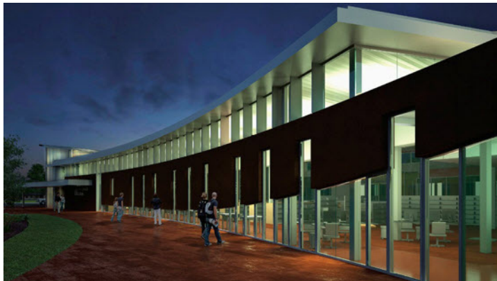
exterior night view

To receive future public art opportunities please send your email address to: roni.thomas@slcgov.com