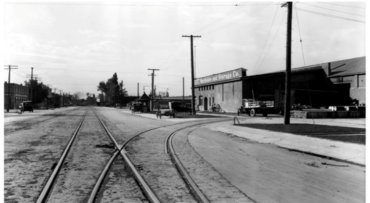
Salt Lake route near the Tying Warehouse and Storage Company c.1920 - Near 700 S 400 W