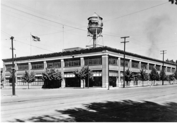
Ford Motor Company c.1939 - 280 S 400 W