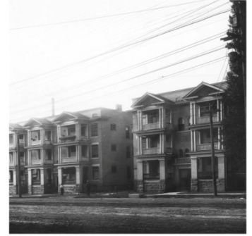
La France Apartments c.1907 - 258 W 300 S