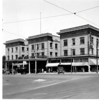
Peery Hotel c.1924 - 110 W Broadway (300 S)