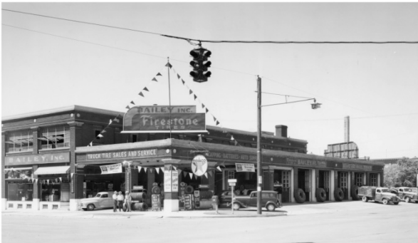
Bailey Tire Company c.1948 - 300 S 314 W