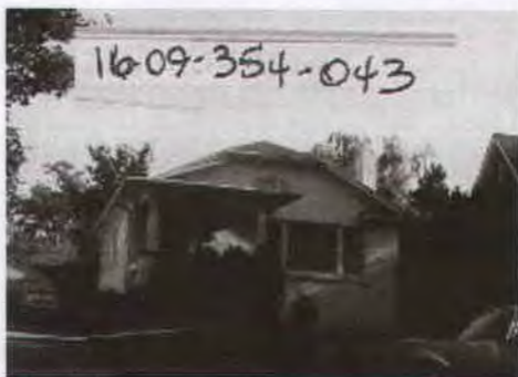
1417 E. 1300 S. Built : 1925 Bungalow