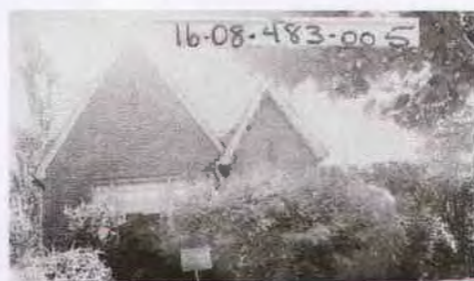
1320 E Laird Ave. Built: 1937 English Cottage/Tudor