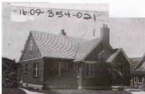
1456 E. Laird Ave. Built: 1936 English Cottage