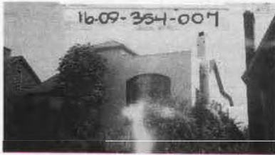
1362 E. Laird Ave Built : 1927 Spanish Colonial Revival