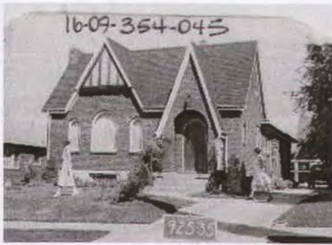
1429 E. 1300 S. Built : 1930 English Tudor