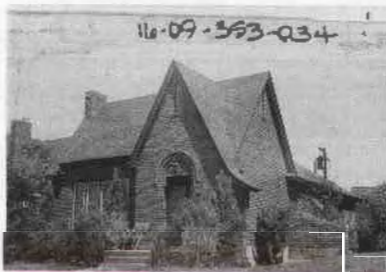
1369 E. Laird Ave. Built: 1930 English Cottage