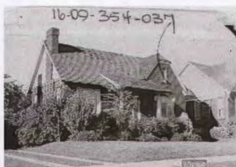
1381 E. 1300 S. Built : 1926 English Cottage