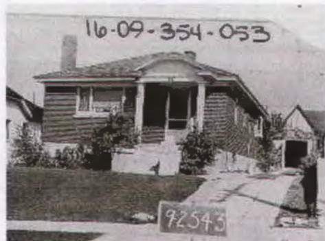
1467 E. 1300 S. Built : 1924 Neoclassical Bungalow