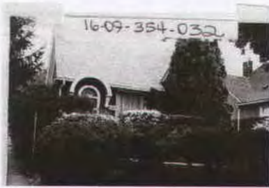
1355 E. 1300 South Built : 1926 English Cottage