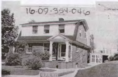
1433 E. 1300 S. Built : 1925 English Cottage