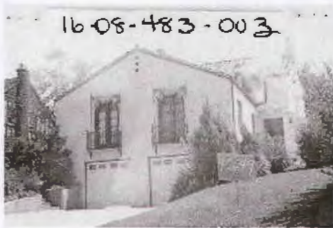
1227-1229 S. 1300 E. Built: 1930 Spanish Col. Revival/ Double House