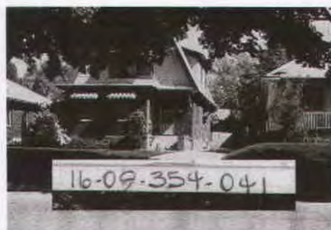
1409 E. 1300 S. Built : 1925 Dutch Col. Revival