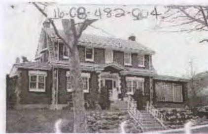
1305 E. Laird Ave. Built : 1932 Colonial revival