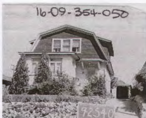
1457 E. 1300 S. Built: 1924 Dutch Col. Revival