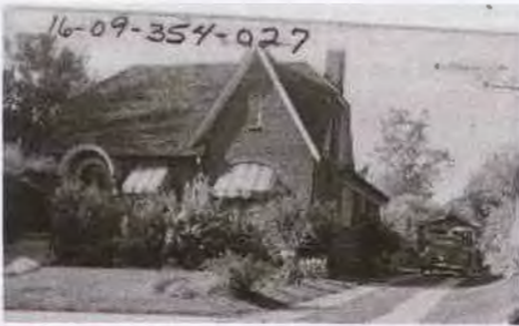
1329 E. 1300 S. Built : 1926 English Cottage