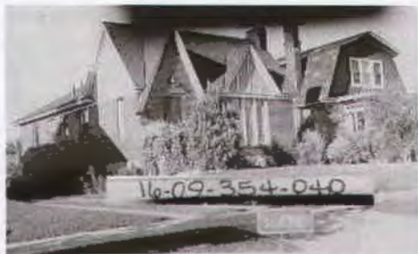
1397 E. 1300 S. Built : 1929 English Tudor