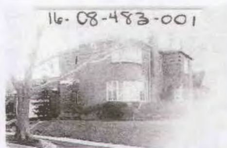
1308 E. Laird Ave. Built : 1939 Art Moderne