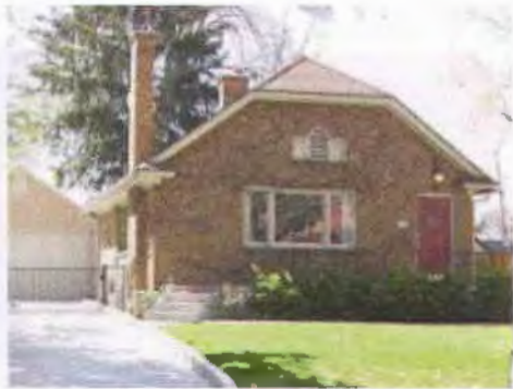
1332 E. Laird Ave. Built: 1927 Bungalow/English cottage