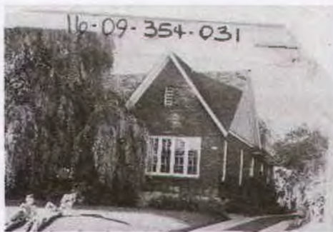
1349 E. 1300 S. Built : 1926 English Cottage