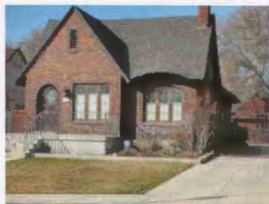
1365 E. 1300 S. Built : 1926 English Cottage