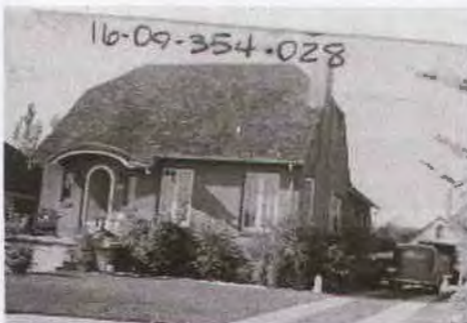
1335 E. 1300 S. Built: 1926 Period Cottage