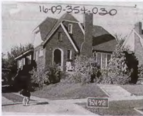
1345 E. 1300 S. Built : 1926 English Cottage