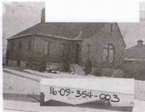
1338 E. Laird Ave. Built : 1927 English cottage