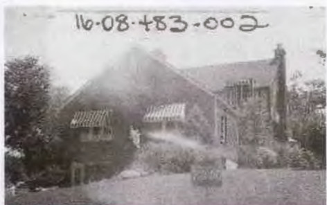
1221-1223 S. 1300 E. Built: 1930 English Tudor /double house