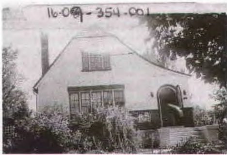
1328 E. Laird Ave Built: 1927 English Cottage