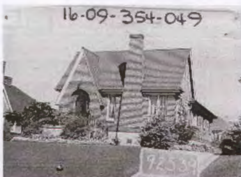
1447 E. 1300 S. Built : 1928 English Cottage