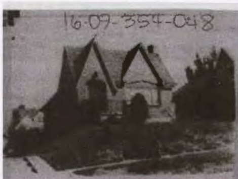
1437 E. 1300 S. Built : 1929 English Cottage