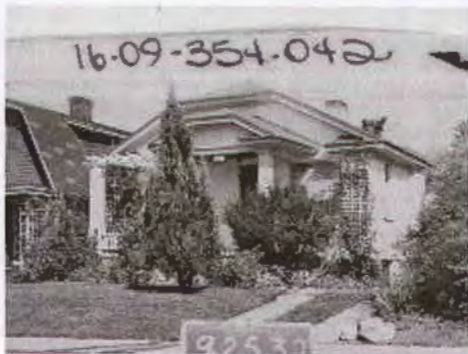
1413 E. 1300 S. Built : 1926 Bungalow