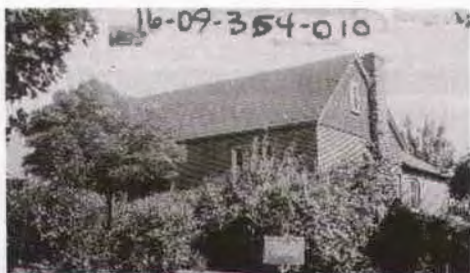
1380 E. Laird Ave Built: 1927 Period Revival/Cottage