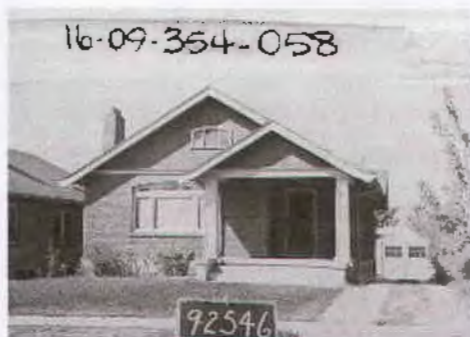
1232 S. 1500 E. Built: 1936 Late 20th Century Bungalow