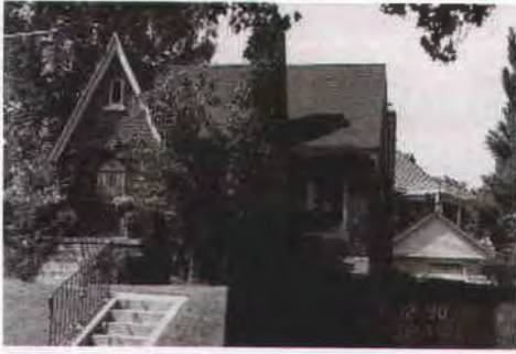
1443 E. Laird Ave. Built : 1929 English Tudor