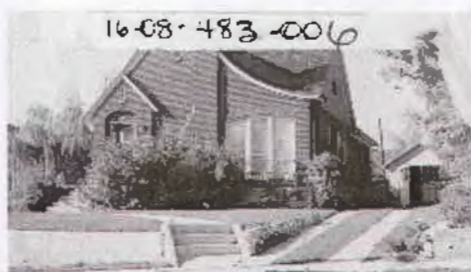
1319 E. 1300 S. Built : 1926 English Cottage