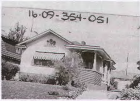
1463 E. 1300 S. Built: 1924 Bungalow