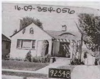
1218 S. 1500 E. Built: 1925 Bungalow