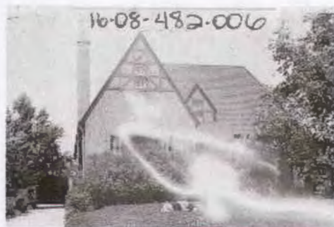
1319 E. Laird Ave Built : 1929 English Cottage/Tudor