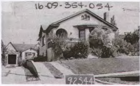
1475 E. 1300 S. Built : 1925 Bungalow