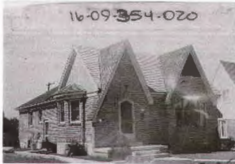
1450 E. Laird Ave. Built: 1935 English Cottage