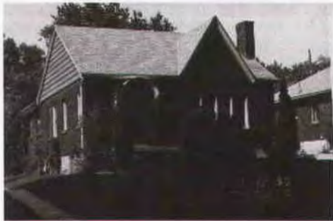
1397 E. Laird Ave. Built : 1927 English Cottage