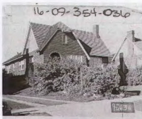
1375 E. 1300 S. Built: 1926 English cottage