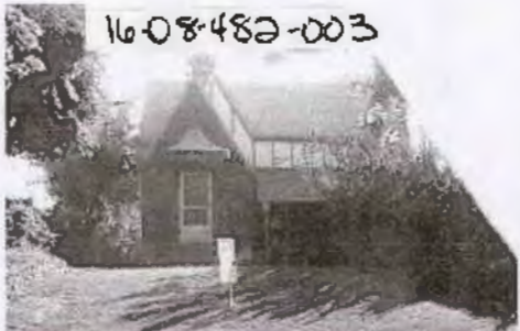
1193 S. 1300 E. Built: 1930 English Tudor