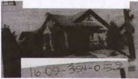
1238 S. 1500 E. Built: 1926 Bungalow