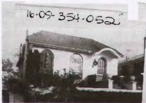
1465 E. 1300 S. Built : 1924 Bungalow