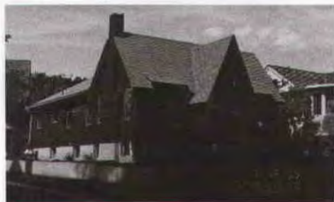
1401 E. Laird Ave. Built: 1930 English Cottage