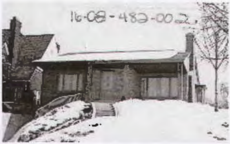
1185 S. 1300 E. Built: 1950 Early ranch