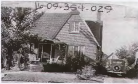
1339 E. 1300 S. Built : 1926 English Cottage