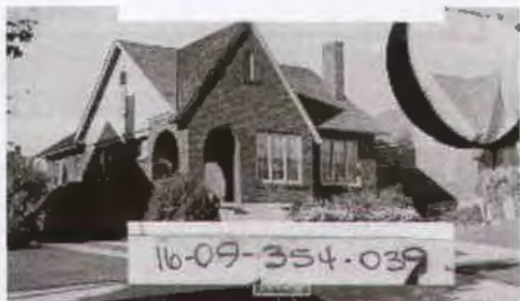
1391 E. 1300 S. Built : 1926 English Cottage