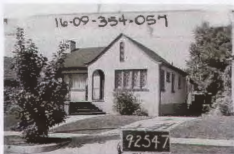
1224 S. 1500 E. Built: 1925 Late 20th Century