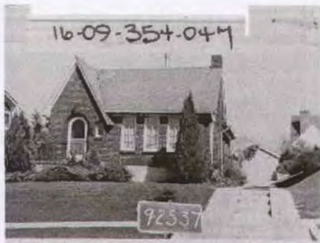
1435 E. 1300 S. Built : 1928 English cottage