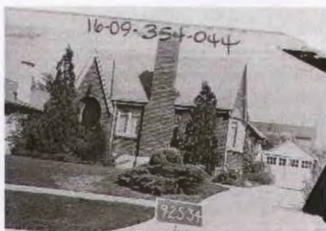
1421 E. 1300 S. Built : 1929 English Cottage