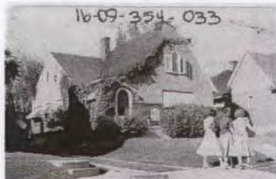
1361 E. 1300 S. Built 1926 English Cottage