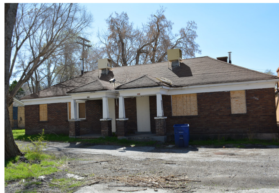
265/67 W Bishop Place Petition #PLNHLC2017-00029