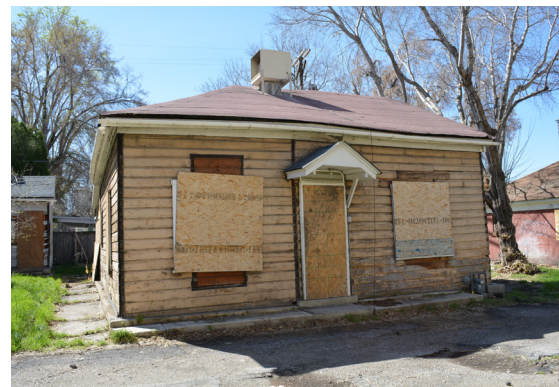
259 W Bishop Place Petition #PLNHLC2017-00025