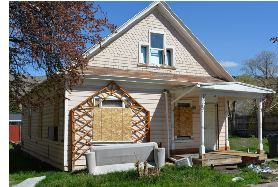
248 W Bishop Place Petition #PLNHLC2017-00020