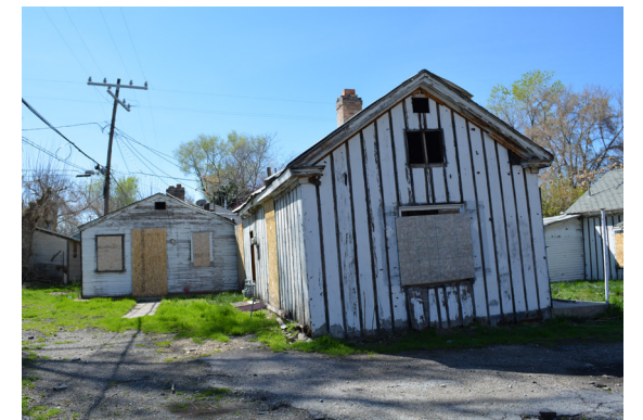
241 W Bishop Place Petition #PLNHLC2017-00017