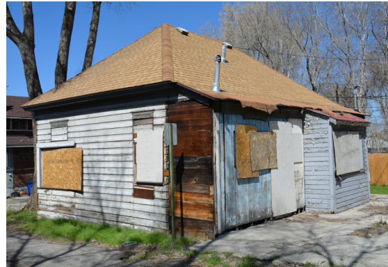
262 W Bishop Place Petition #PLNHLC2017-00026