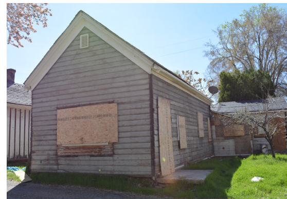
249 W Bishop Place Petition #PLNHLC2017-00019