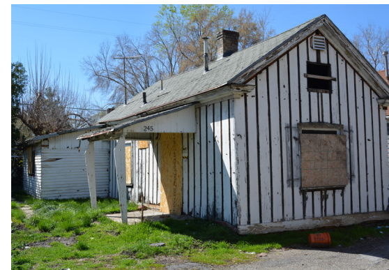
245 W Bishop Place Petition #PLNHLC2017-00016