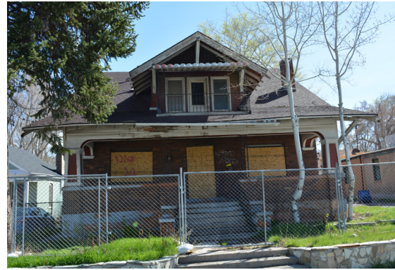
432 N 300 West Petition #PLNHLC2017-00030