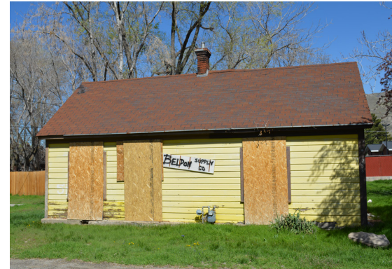
258 W Bishop Place Petition #PLNHLC2017-00024