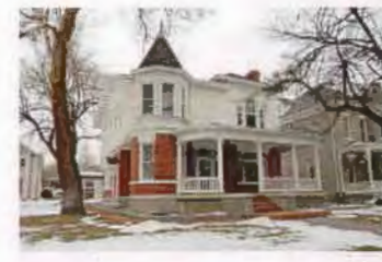
551 E SOUTH TEMPLE SC