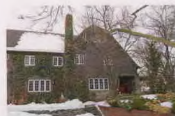
34 S HAXTON PLACE SC