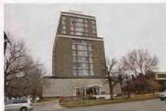
777 E SOUTH TEMPLE OP