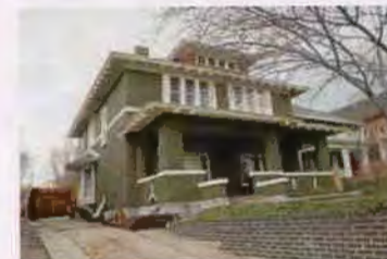
1021 E SOUTH TEMPLE EC