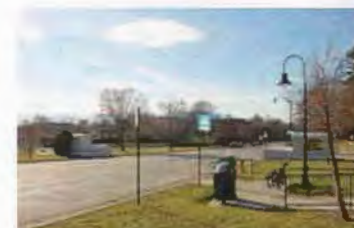
1160? E SOUTH TEMPLE EC