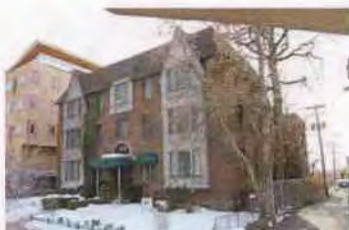
326 E SOUTH TEMPLE SC