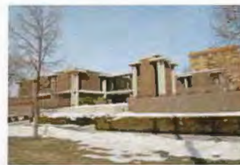
505 E SOUTH TEMPLE OP