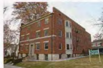
1321 E SOUTH TEMPLE SC