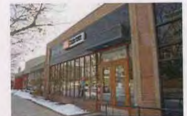
222 E SOUTH TEMPLE NC