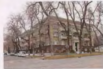
839 E SOUTH TEMPLE SC