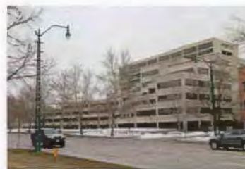
550/60 E SOUTH TEMPLE OP