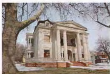
529 E SOUTH TEMPLE SC