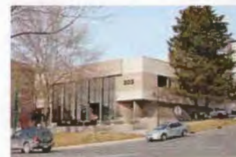
303 E SOUTH TEMPLE OP