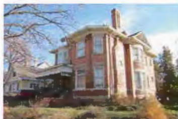
1106 E SOUTH TEMPLE EC