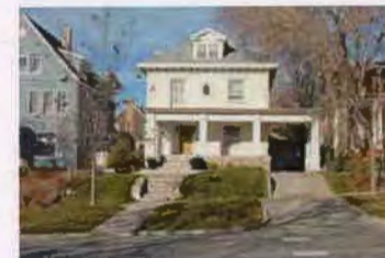
1207 E SOUTH TEMPLE EC