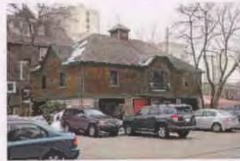
818 E SOUTH TEMPLE EC