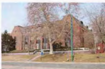
275 E SOUTH TEMPLE OP