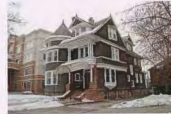
824 E SOUTH TEMPLE SC