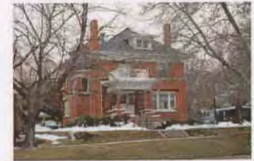
837 E SOUTH TEMPLE SC