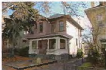
1268 E SOUTH TEMPLE SC