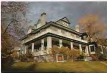
943 E SOUTH TEMPLE EC