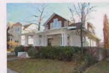
1250 E SOUTH TEMPLE EC