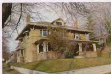
1001 E SOUTH TEMPLE SC