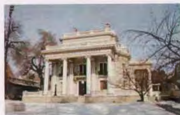
411 E SOUTH TEMPLE EC/S