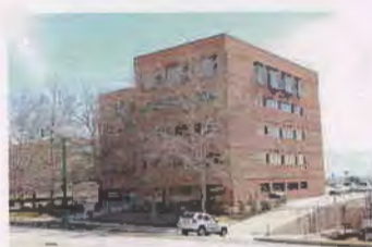
370 E SOUTH TEMPLE OP