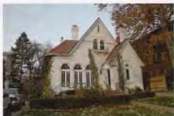
1327 E SOUTH TEMPLE EC