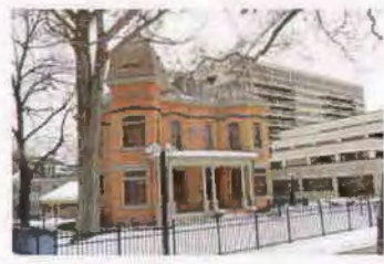
576 E SOUTH TEMPLE SC