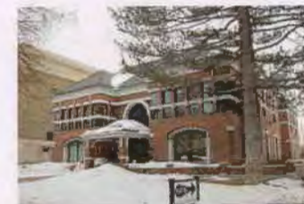
630 E SOUTH TEMPLE OP