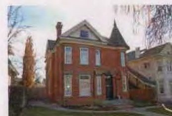
1244 E SOUTH TEMPLE EC