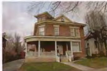
969 E SOUTH TEMPLE SC