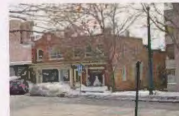
430 E SOUTH TEMPLE ES