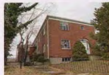
1007 E SOUTH TEMPLE EC