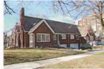
926 E SOUTH TEMPLE SC