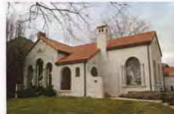
973 E SOUTH TEMPLE SC