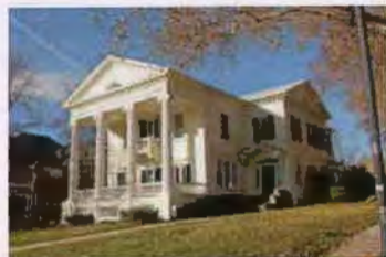
1177 E SOUTH TEMPLE ES