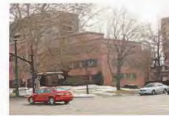
508 E SOUTH TEMPLE EC