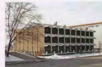
348 E SOUTH TEMPLE ES