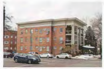
1280 E SOUTH TEMPLE SC