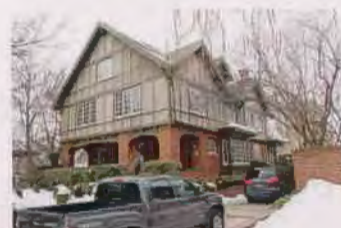
32 S HAXTON PLACE SC