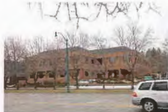
709 E SOUTH TEMPLE OP