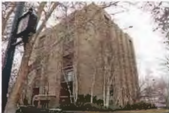
908 E SOUTH TEMPLE OP