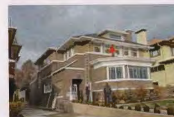
1061 E SOUTH TEMPLE EC