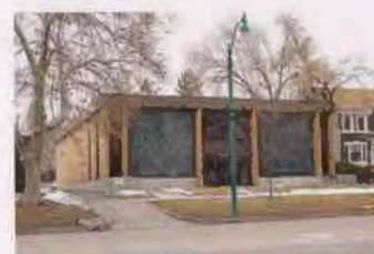
649 E SOUTH TEMPLE OP