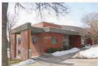
230 E SOUTH TEMPLE NC