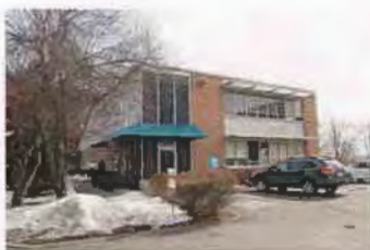
312 E SOUTH TEMPLE SC