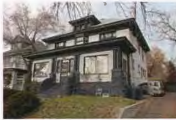
951 E SOUTH TEMPLE EC