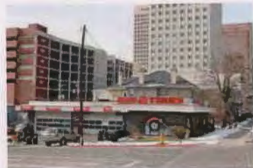
178 E SOUTH TEMPLE NC