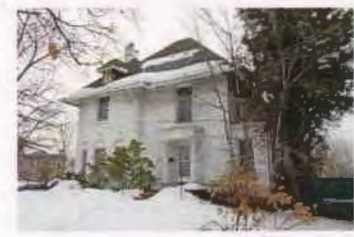
1176 E SOUTH TEMPLE EC