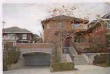
1035 E SOUTH TEMPLE OP