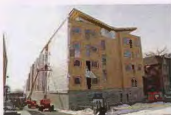
338 E SOUTH TEMPLE OP