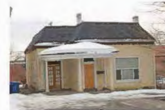
744 E SOUTH TEMPLE EC