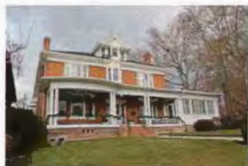
1081 E SOUTH TEMPLE EC