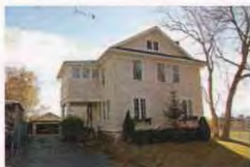
1164 E SOUTH TEMPLE ES