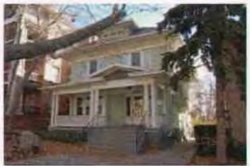
1274 E SOUTH TEMPLE EC