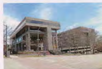
420 E SOUTH TEMPLE OP