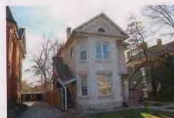
1242 E SOUTH TEMPLE EC