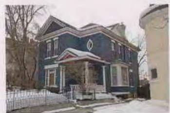
1240 E SOUTH TEMPLE EC