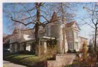
1224 E SOUTH TEMPLE EC