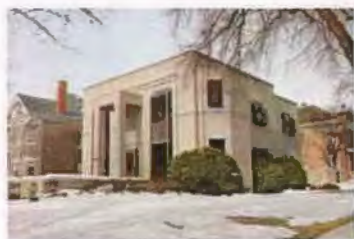
559 E SOUTH TEMPLE NC