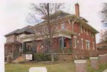
1037 E SOUTH TEMPLE EC