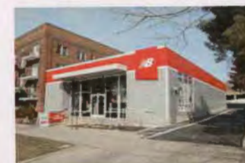
445 E SOUTH TEMPLE EC