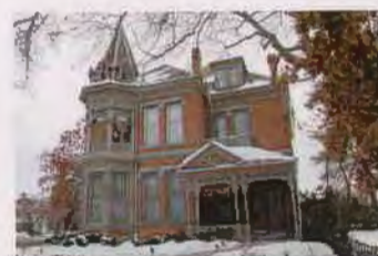
678 E SOUTH TEMPLE SC