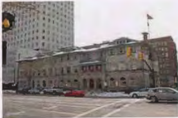
100 E SOUTH TEMPLE ES