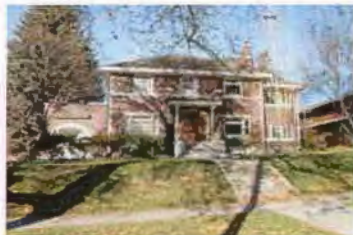
1259 E SOUTH TEMPLE EC