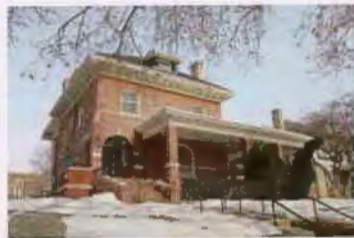
341 E SOUTH TEMPLE ES