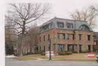
699 E SOUTH TEMPLE OP