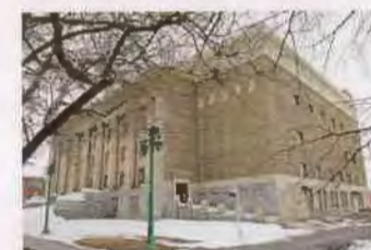
650 E SOUTH TEMPLE SC