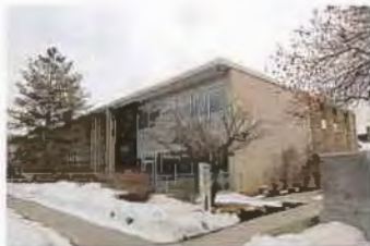
702 E SOUTH TEMPLE EC