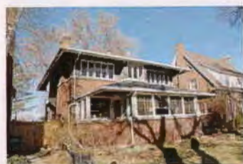
16 S HAXTON PLACE SC