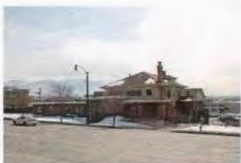
260 E SOUTH TEMPLE EC