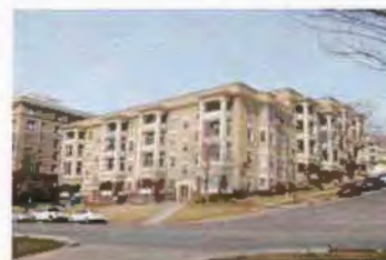
241-9 E SOUTH TEMPLE SC