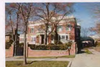
1229 E SOUTH TEMPLE ES