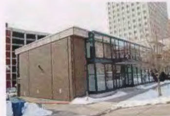
160 E SOUTH TEMPLE OP