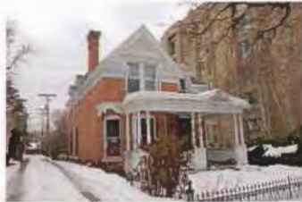
920 E SOUTH TEMPLE SC