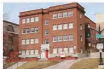
283 E SOUTH TEMPLE SC