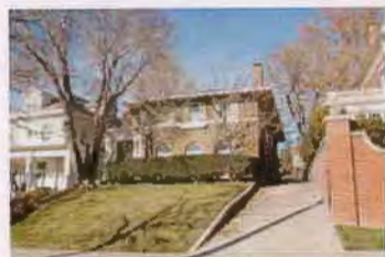
1219 E SOUTH TEMPLE EC