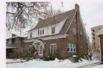
12 S HAXTON PLACE SC