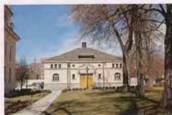
603 E SOUTH TEMPLE CARRIAGE HOUSE