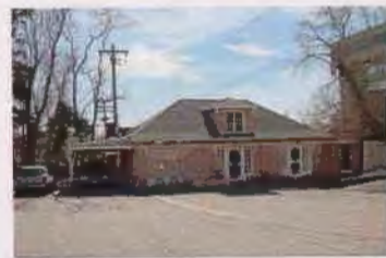
434 E SOUTH TEMPLE EC/rear