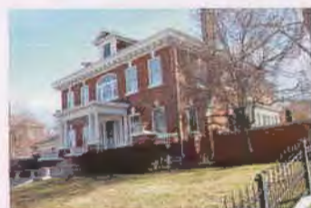
19 S HAXTON PLACE EC