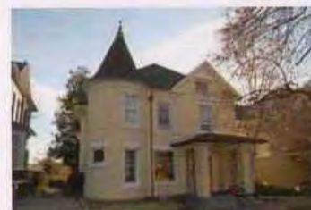
1228 E SOUTH TEMPLE SC