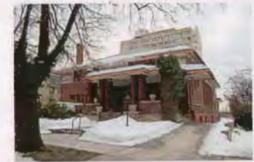
850 E SOUTH TEMPLE SC