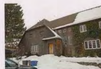
35 S HAXTON PLACE SC