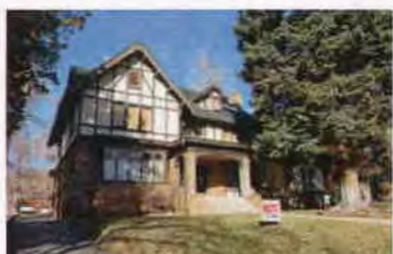
1127 E SOUTH TEMPLE EC