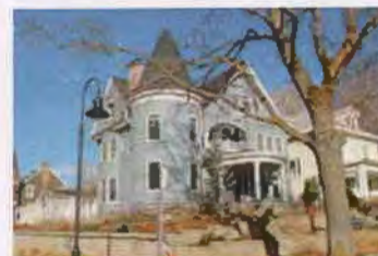
1205 E SOUTH TEMPLE SC