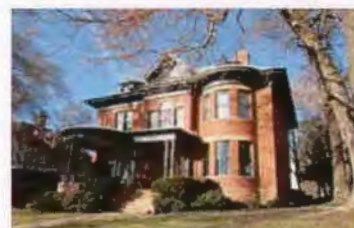
1135 E SOUTH TEMPLE ES