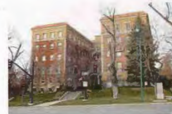
1283 E SOUTH TEMPLE SC