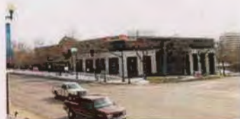
200 E SOUTH TEMPLE NC