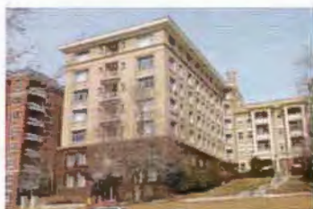
239 E SOUTH TEMPLE SC