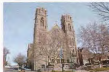
331 E SOUTH TEMPLE SC