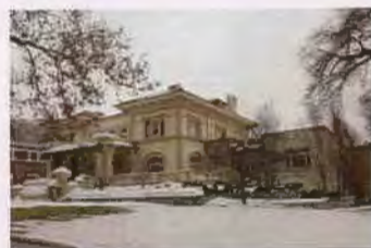
610 E SOUTH TEMPLE SC