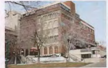
139 E SOUTH TEMPLE EC