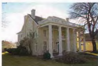
1116 E SOUTH TEMPLE ES