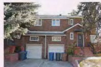
3/7 S HAXTON PLACE SC