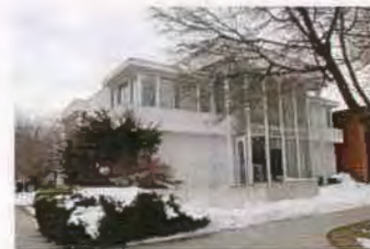
780 E SOUTH TEMPLE NC