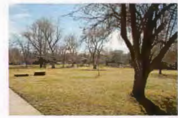
1324? E SOUTH TEMPLE