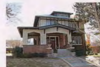
31 S HAXTON PLACE SC