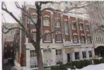
140 E SOUTH TEMPLE EC