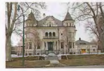
603 E SOUTH TEMPLE SC