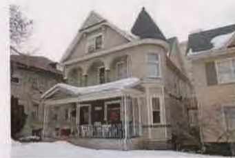
866 E SOUTH TEMPLE EC