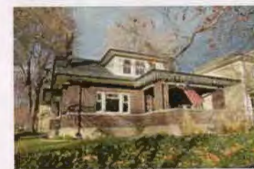
1053 E SOUTH TEMPLE EC