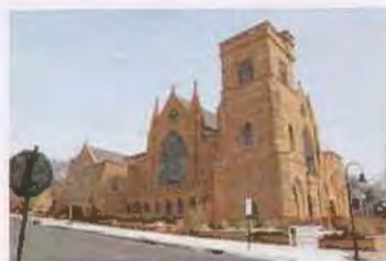
12 N C STREET SC