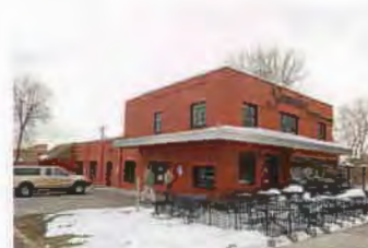
754 E SOUTH TEMPLE EC