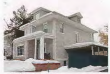
1172 E SOUTH TEMPLE EC