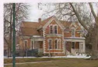
617 E SOUTH TEMPLE EC