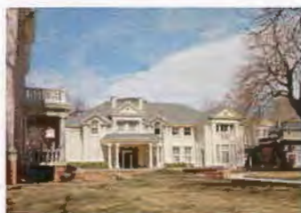
535 E SOUTH TEMPLE SC