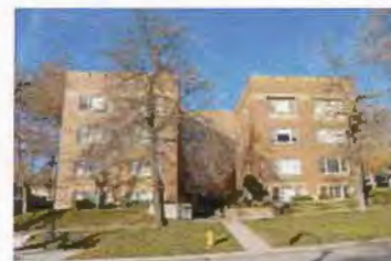
1107 E SOUTH TEMPLE EC