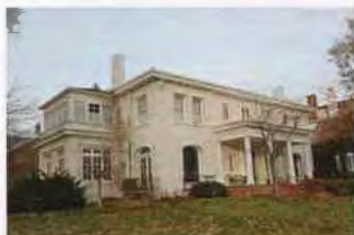
1309 E SOUTH TEMPLE EC