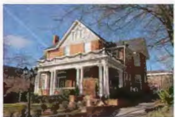
1167 E SOUTH TEMPLE ES