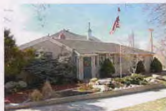
1204 E SOUTH TEMPLE EC