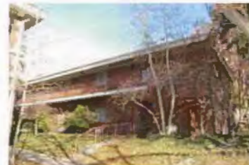
1263 E SOUTH TEMPLE OP