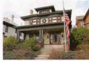
955 E SOUTH TEMPLE SC