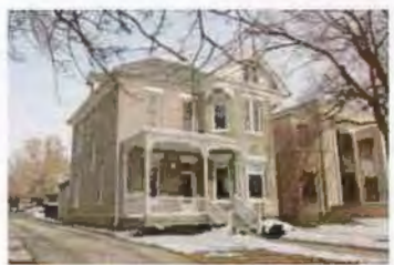
555 E SOUTH TEMPLE EC