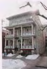
150 E SOUTH TEMPLE ES