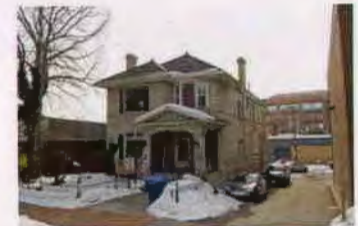
174 E SOUTH TEMPLE EC