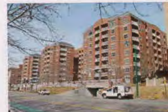
201 E SOUTH TEMPLE OP