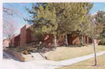
30 N R STREET OP