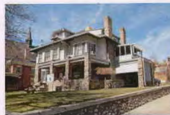
347 E SOUTH TEMPLE ES