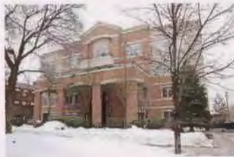
838 E SOUTH TEMPLE OP