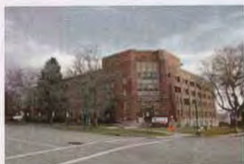
1002 E SOUTH TEMPLE ES