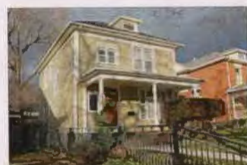
1053 E SOUTH TEMPLESC