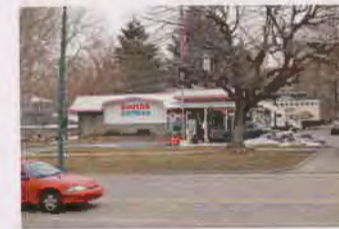
873 E SOUTH TEMPLE NC