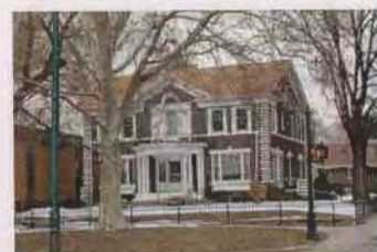
667 E SOUTH TEMPLE SC