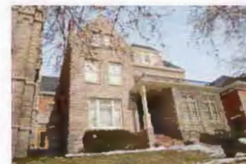
333 E SOUTH TEMPLE SC