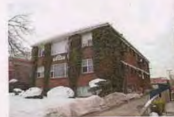
848 E SOUTH TEMPLE EC