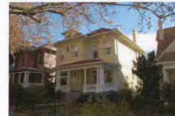
1264 E SOUTH TEMPLE SC