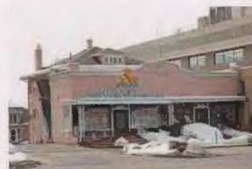
434 E SOUTH TEMPLE EC