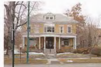
731 E SOUTH TEMPLE SC