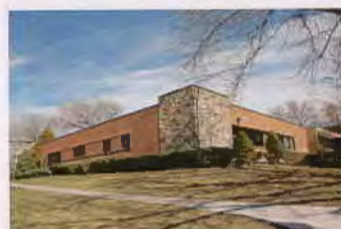
633 E SOUTH TEMPLE SC