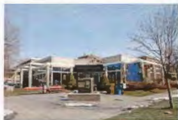
481 E SOUTH TEMPLE OP