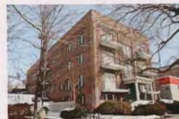
435 E SOUTH TEMPLE EC