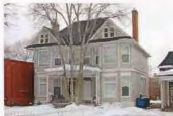
750 E SOUTH TEMPLE EC