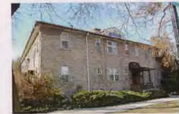
874 E SOUTH TEMPLE EC