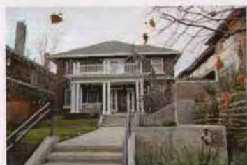
1027 E SOUTH TEMPLE EC