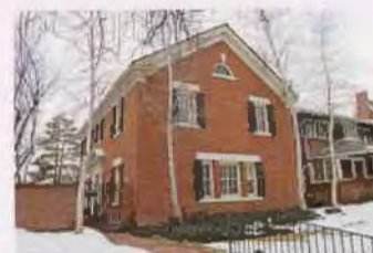
22 S HAXTON PLACE SC