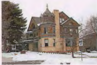
808 E SOUTH TEMPLE SC