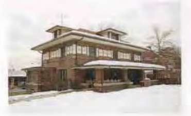
974 E SOUTH TEMPLE SC