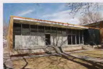
641 E SOUTH TEMPLE EC