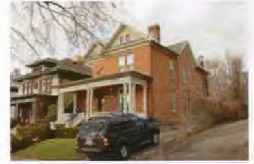
963 E SOUTH TEMPLE SC