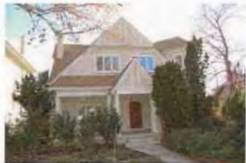
1256 E SOUTH TEMPLE EC