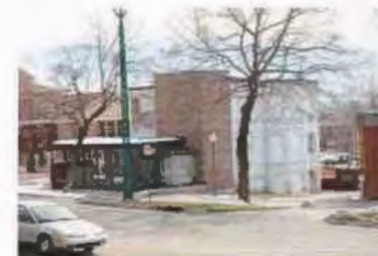
242 E SOUTH TEMPLE NC