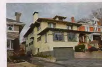
1067 E SOUTH TEMPLE EC