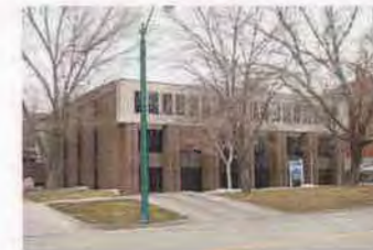
807 E SOUTH TEMPLE OP