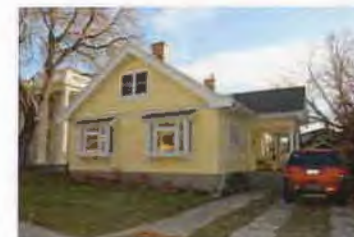
1108 E SOUTH TEMPLE EC