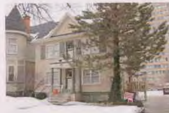
862 E SOUTH TEMPLE EC