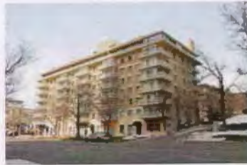
109 E SOUTH TEMPLE OP