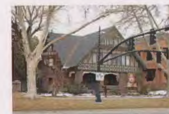
701 E SOUTH TEMPLE SC