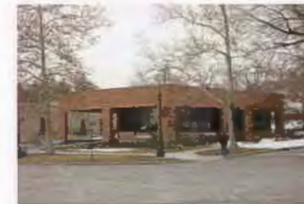
769 E SOUTH TEMPLE OP