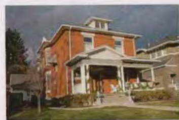
1059 E SOUTH TEMPLE EC