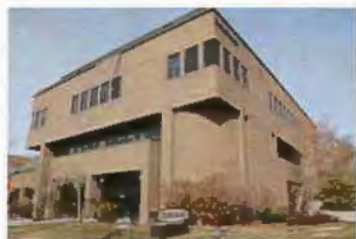
455 E SOUTH TEMPLE OP