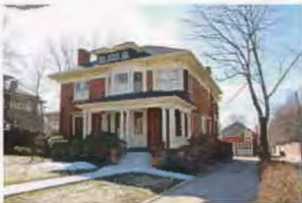
966 E SOUTH TEMPLE SC