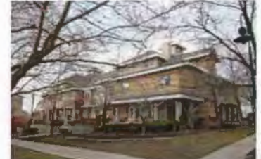
935 E SOUTH TEMPLE OP