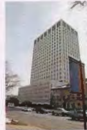
136 E SOUTH TEMPLE OP