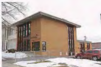
770 E SOUTH TEMPLE NC