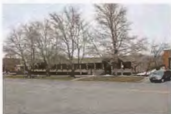
747 E SOUTH TEMPLE OP