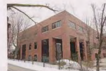
24 S 1100 EAST OP