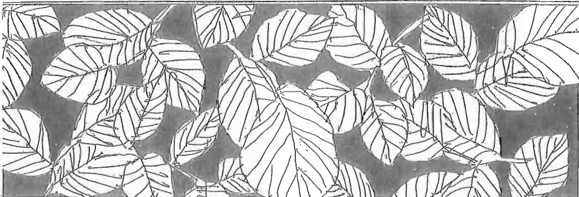
BAS RELIEF DETAIL

THE STATELY, HIGH BRANCHING GRACE OF THE ELM TREE