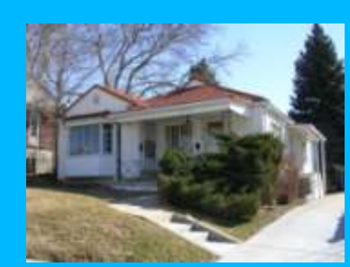
1310 E 900 SOUTH B