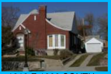
1319 E 1300 SOUTH A