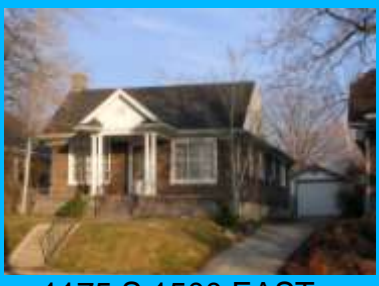
1175 S 1500 EAST A