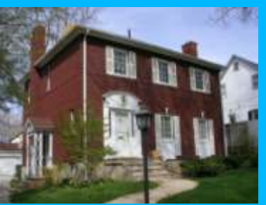
996 S 1700 EAST