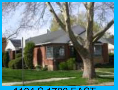
1194 S 1700 EAST A