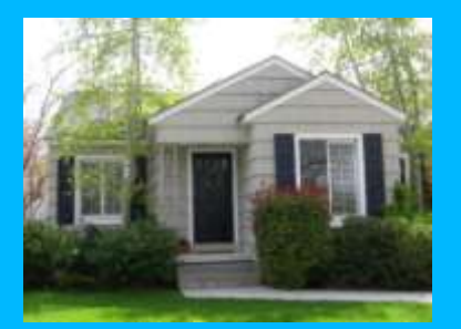
1205 S 1700 EAST