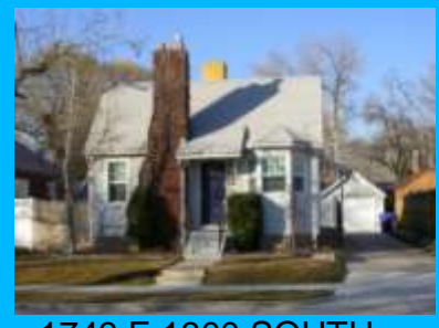
1743 E 1300 SOUTH B