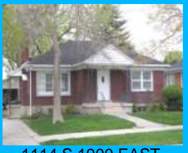
1114 S 1900 EAST A