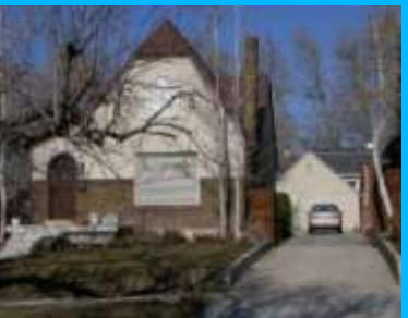
1361 E 1300 SOUTH B