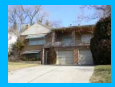
1131 S 1300 EAST В