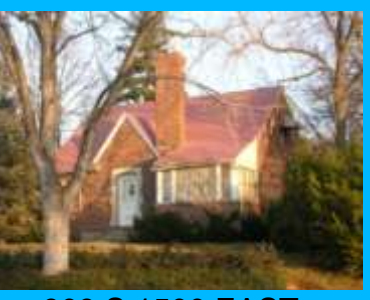
909 S 1500 EAST A