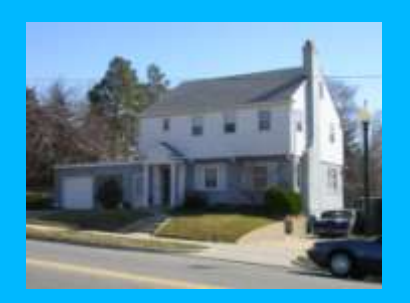
1354 E 900 SOUTH B