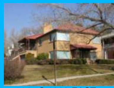
1147 S 1300 EAST В