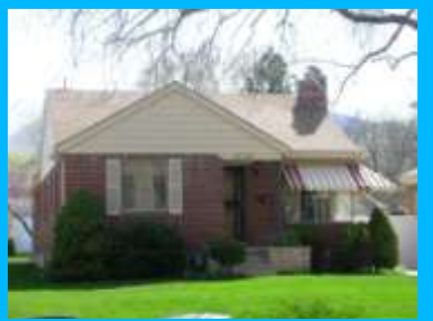
1117 S 1800 EAST A