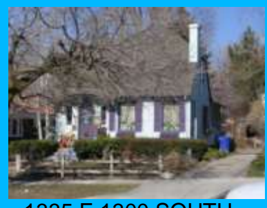
1335 E 1300 SOUTH B