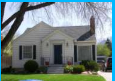
1219 S 1800 EAST