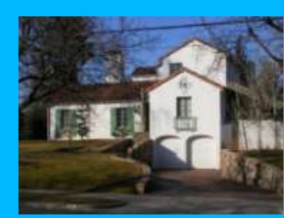
1100 S 1500 EAST A