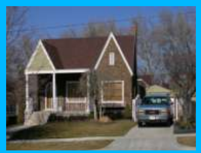
1371 E 1300 SOUTH B