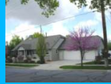
1028 S 1900 EAST B