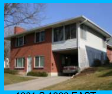
1001 S 1300 EAST D