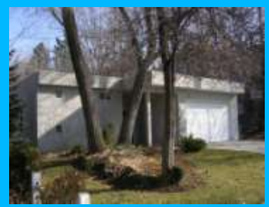
933 S 1300 EAST D