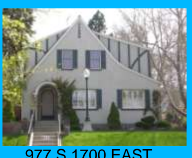
977 S 1700 EAST C