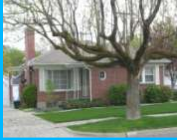
1222 S 1900 EAST A