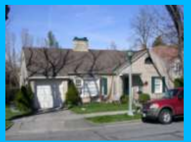
1150 S 1400 EAST Δ