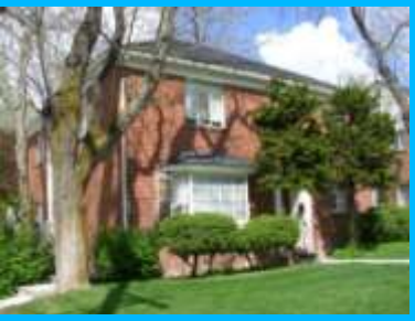
860 S 1900 EAST A