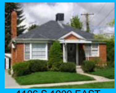
1106 S 1900 EAST B