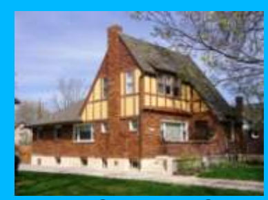
1042 S 1700 EAST C