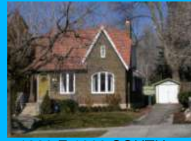
1329 E 1300 SOUTH A