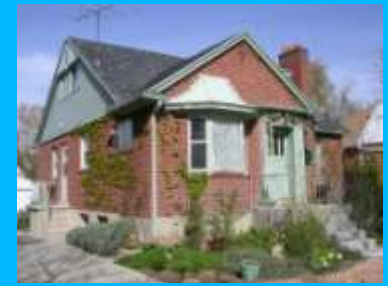
1208 S 1700 EAST B