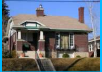
1016 S 1500 EAST