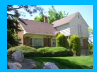
1066 S 1500 EAST A