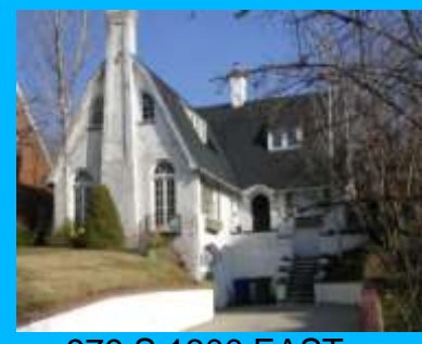
979 S 1300 EAST A