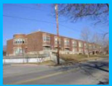
1571 E 1300 SOUTH D