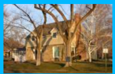
923 S 1500 EAST B