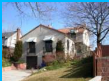
1227 S 1300 EAST