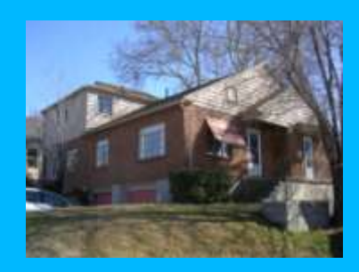
1326 E 900 SOUTH A