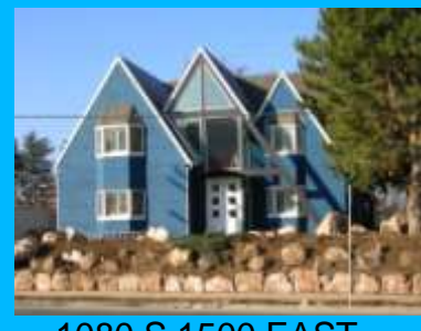
1080 S 1500 EAST C