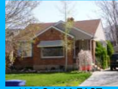
1105 S 1800 EAST A