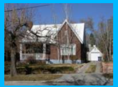
1349 E 1300 SOUTH B