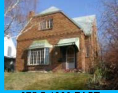
975 S 1300 EAST A