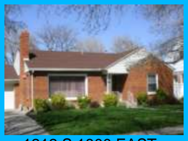
1212 S 1800 EAST