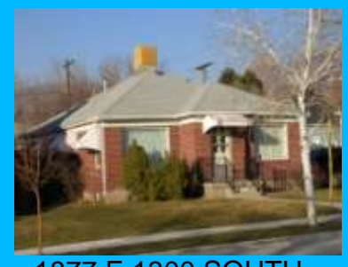
1877 E 1300 SOUTH A