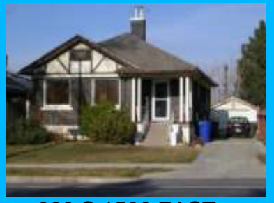
938 S 1500 EAST A