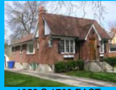
1052 S 1700 EAST A