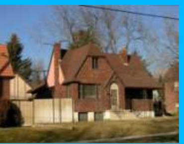
1623 E 1300 SOUTH A