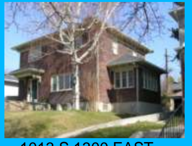
1013 S 1300 EAST Α