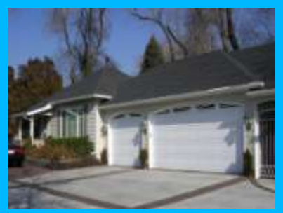
921 S 1300 EAST C