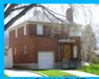
1121 S 1800 EAST A