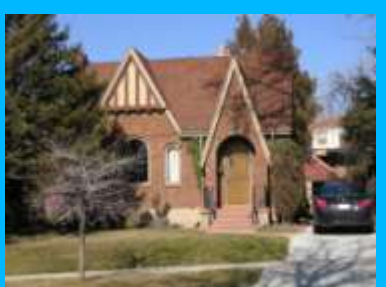
1429 E 1300 SOUTH A