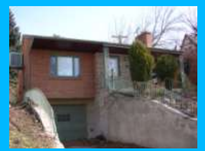
1185 S 1300 EAST A