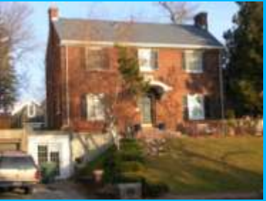
1017 S 1500 EAST A