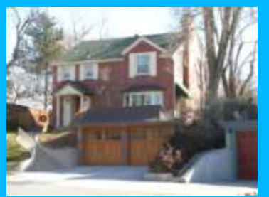
1404 E 900 SOUTH