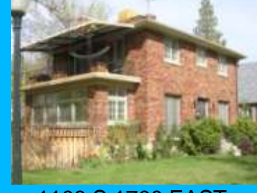
1108 S 1700 EAST A