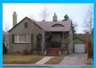
1218 S 1500 EAST