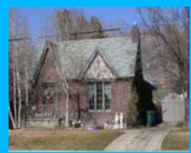
1397 E 1300 SOUTH A