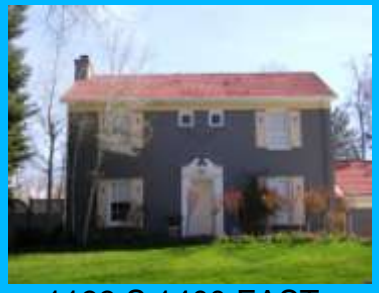
1133 S 1400 EAST A