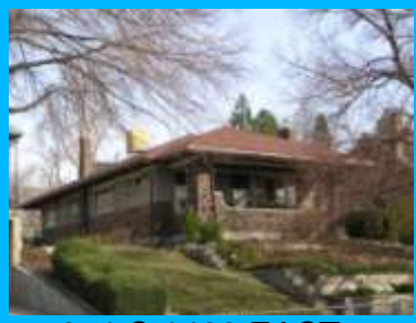
871 S 1400 EAST A