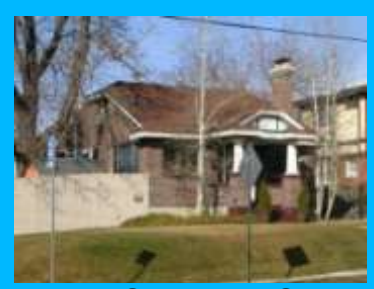
998 S 1500 EAST