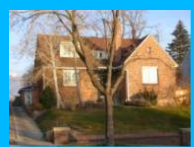
1005 S 1500 EAST B