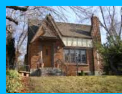
1193 S 1300 EAST A