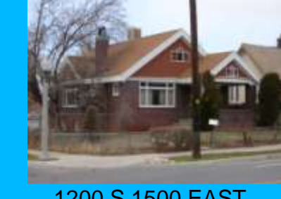
1200 S 1500 EAST В