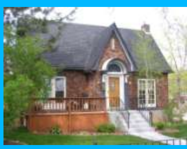
1024 S 1700 EAST