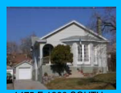
1475 E 1300 SOUTH B