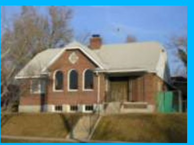
1201 S 1500 EAST В