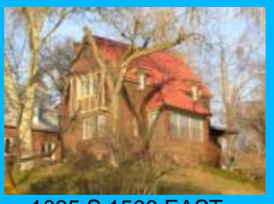
1035 S 1500 EAST