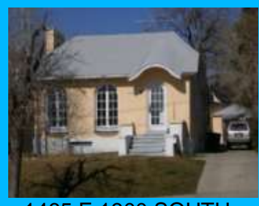
1465 E 1300 SOUTH A