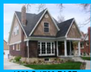
1058 S 1700 EAST C