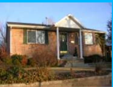
957 S 1500 EAST D