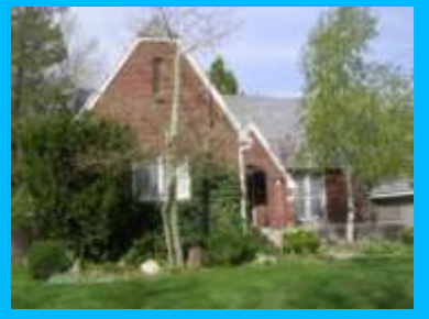
1102 S 1700 EAST