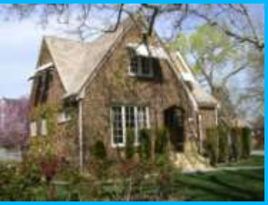
1134 S 1700 EAST A