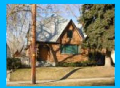
1595 E 1300 SOUTH B