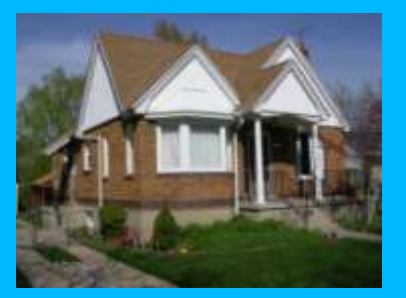
987 S 1700 EAST A