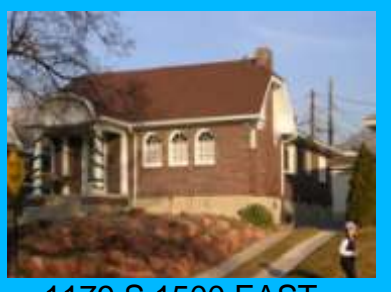
1179 S 1500 EAST A