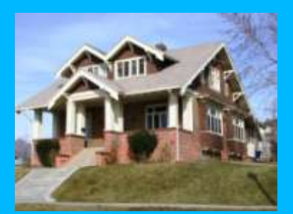
851 S 1400 EAST A