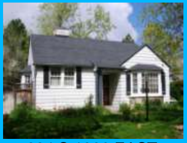
924 S 1900 EAST A