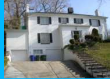
1121 S 1300 EAST Α