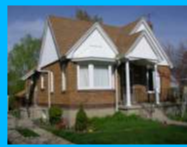
1202 S 1700 EAST A