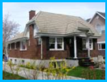
1064 S 1700 EAST B