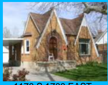
1170 S 1700 EAST A