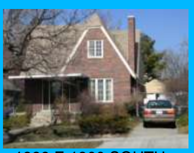
1339 E 1300 SOUTH B