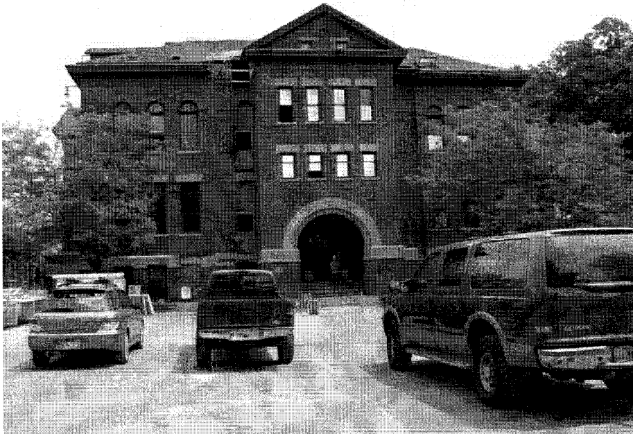
Photo 3. West elevation.