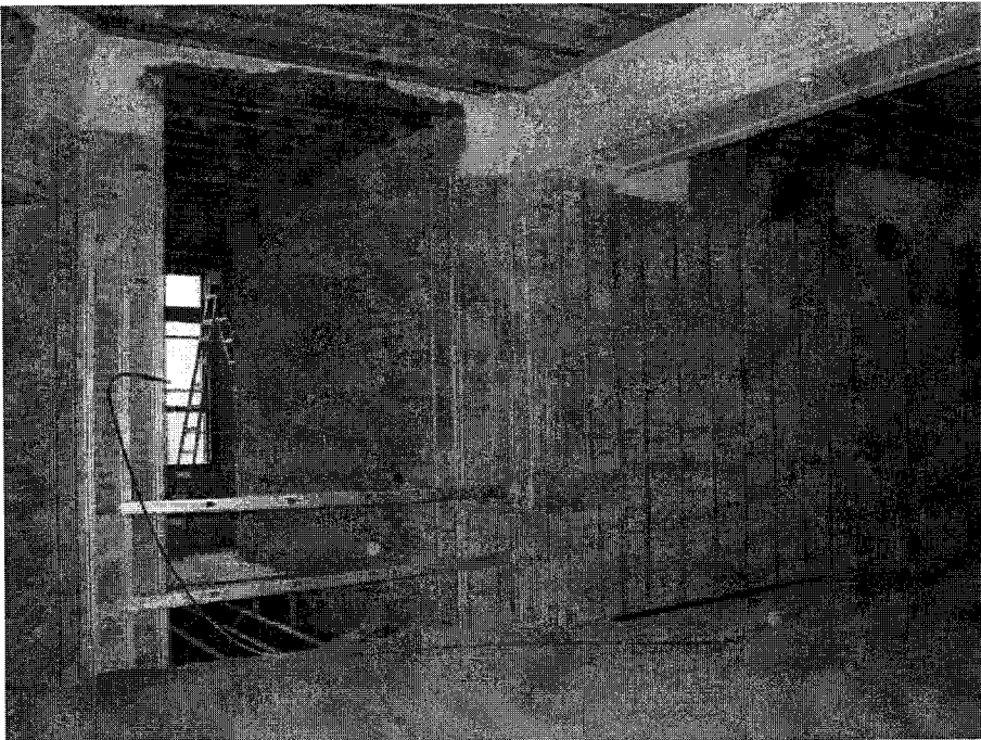
Photo 7. Main floor, central hall, showing brick bearing walls, original box beam and cornice.