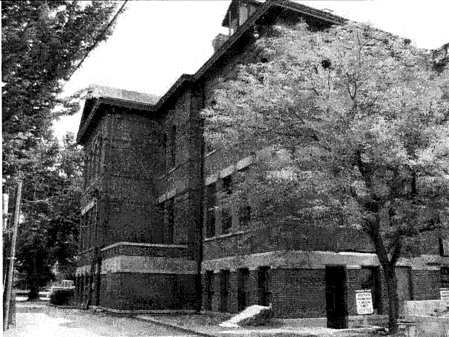
Photo 2. North elevation.

Oquirrh School, Salt Lake City, Salt Lake County, UT