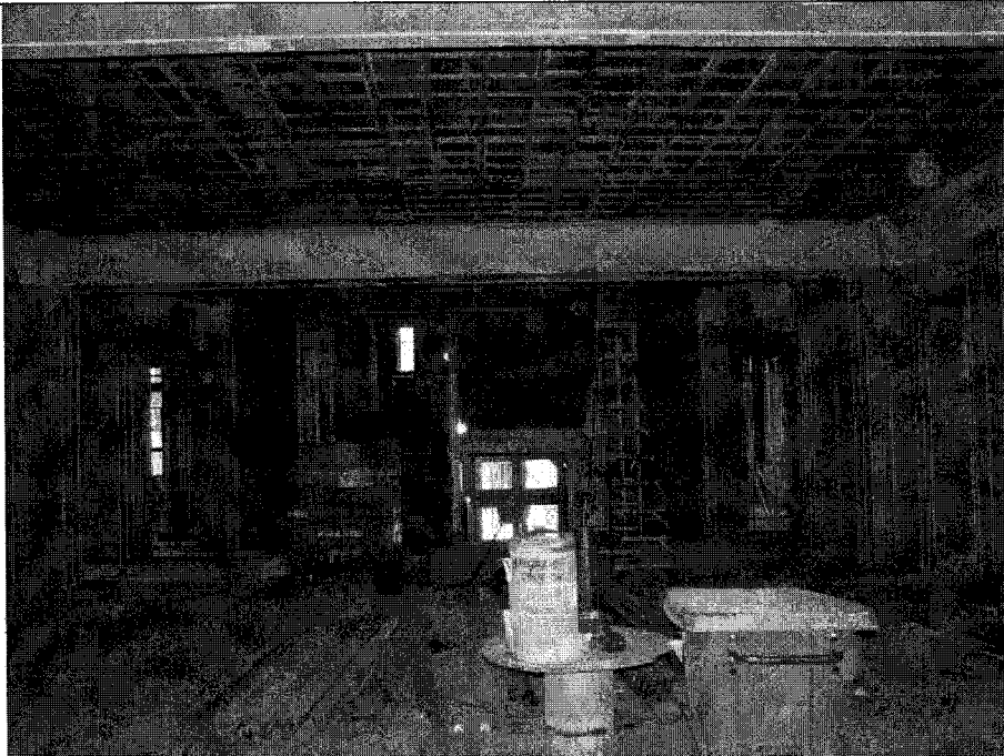
Photo 6. Main floor, central hall.

Oquirrh School, Salt Lake City, Salt Lake County, UT