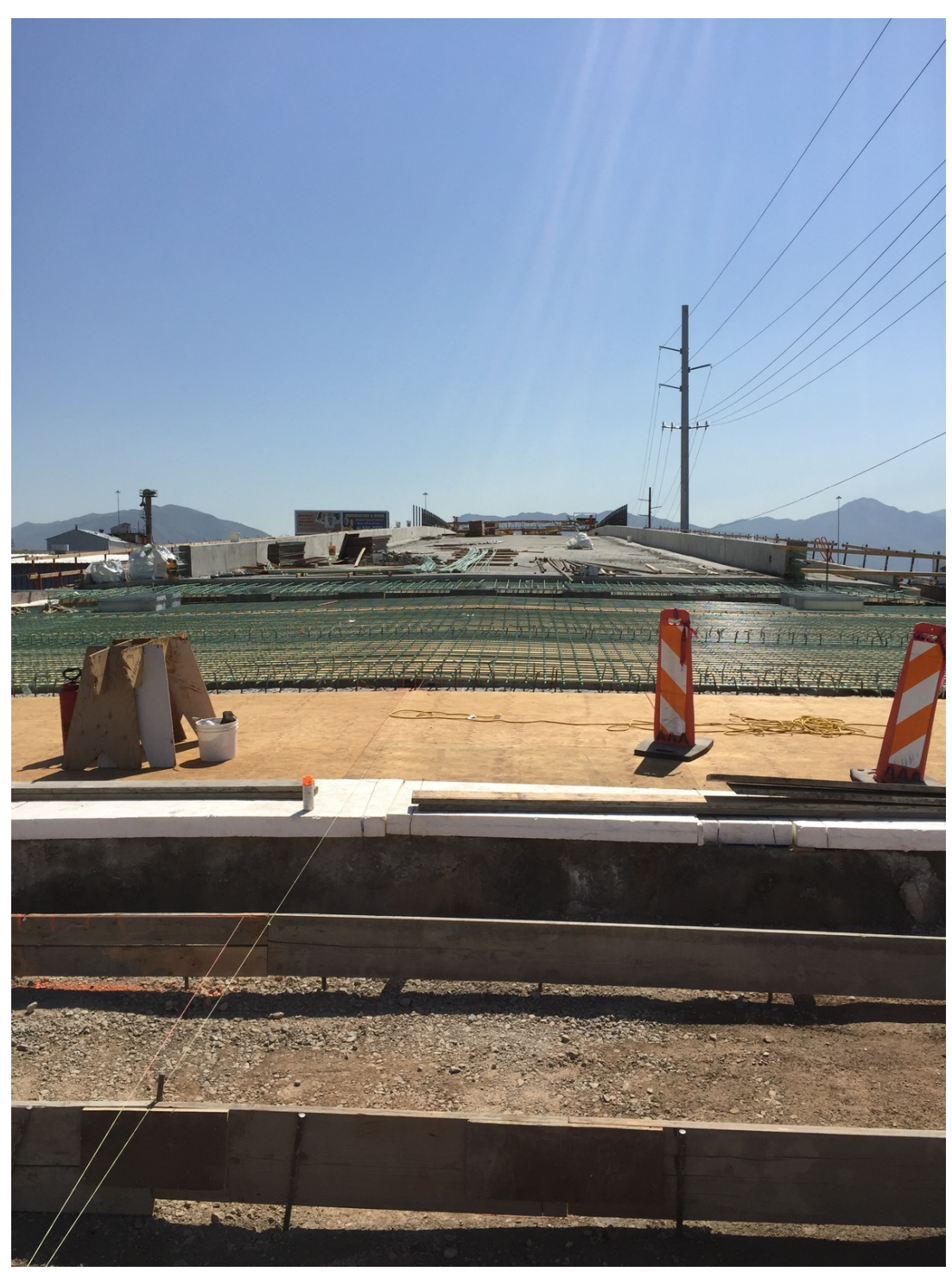
Forming the west side bridge approach