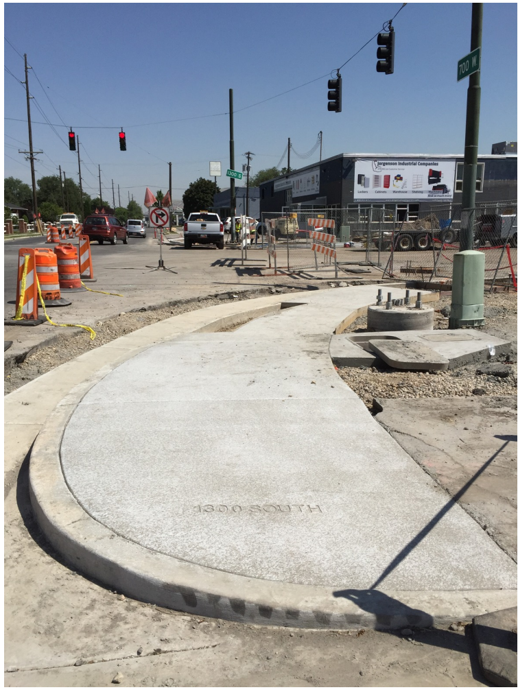
Work on the new intersection at 700 West