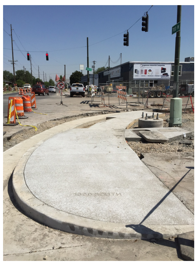
Work on the new intersection at 700 West