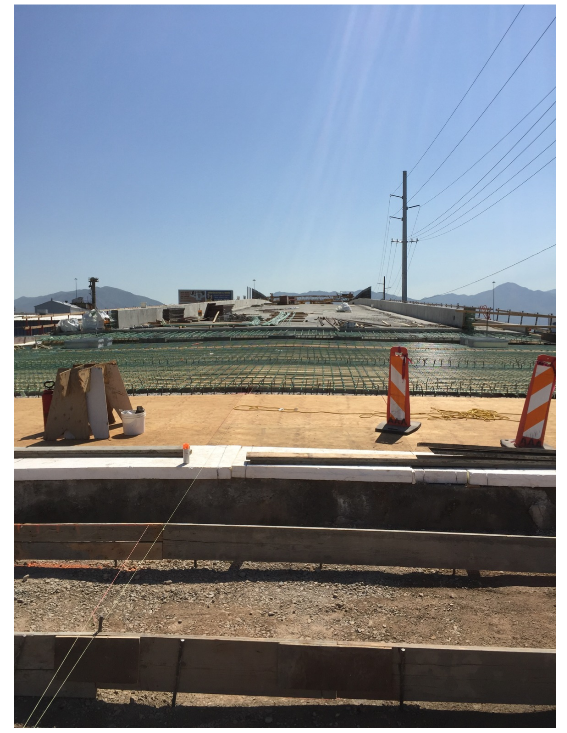
Forming the west side bridge approach