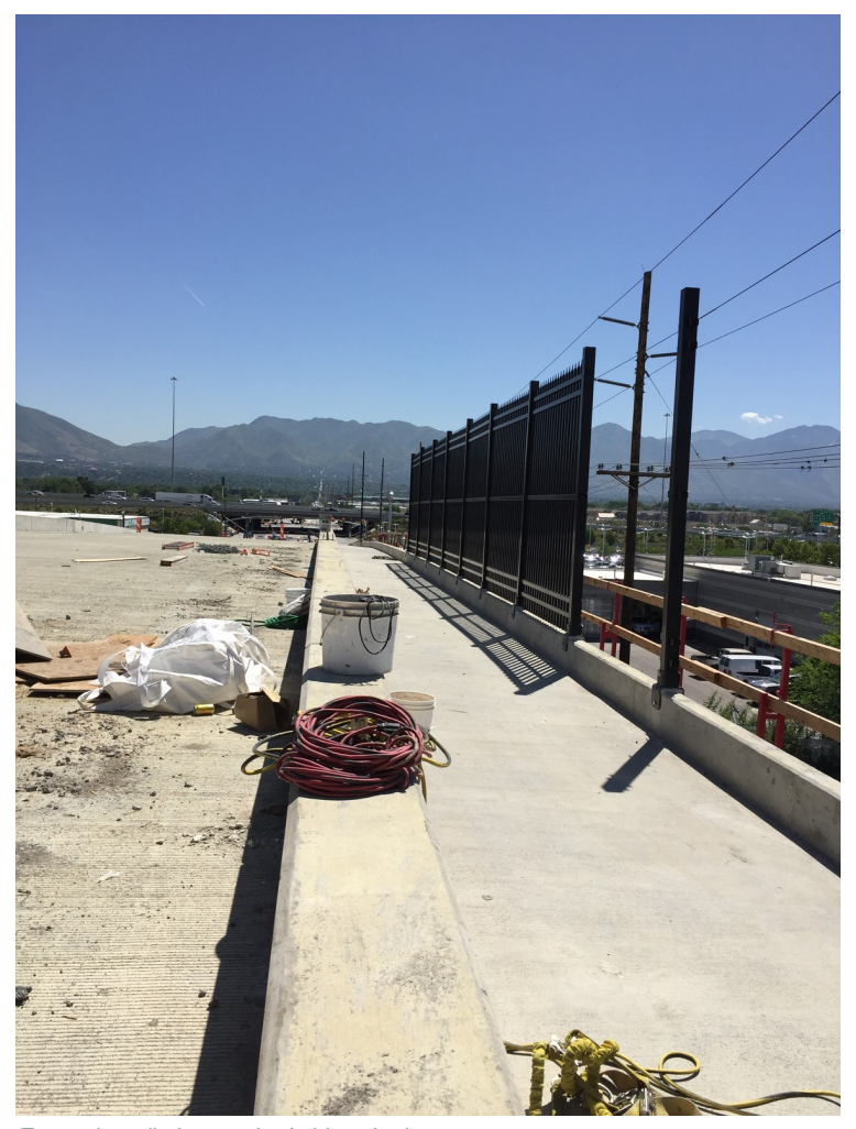
Fence installation on the bridge deck