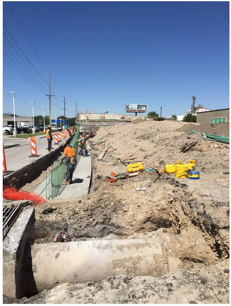
Crews forming the east side retaining walls