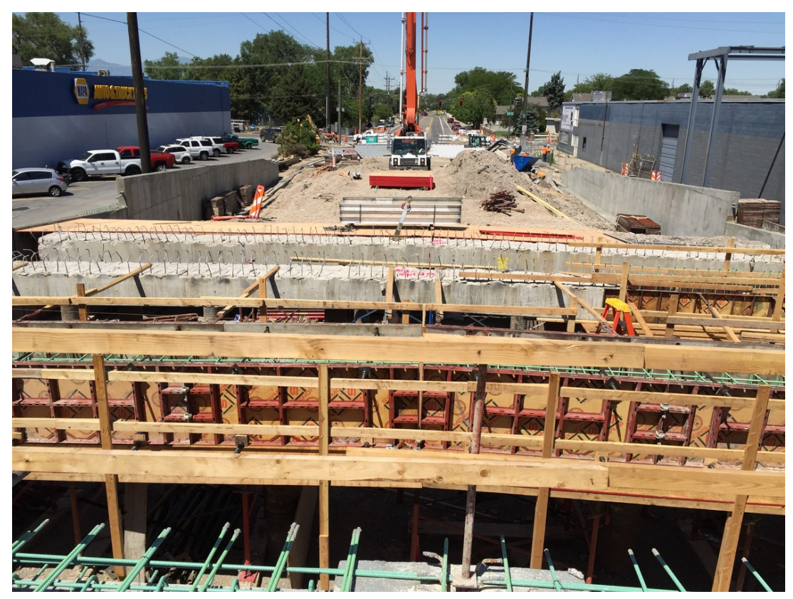
Forming the west side pile slab