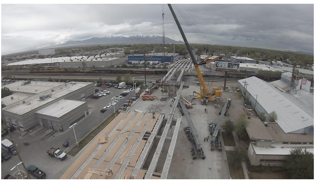
Aerial view of the project