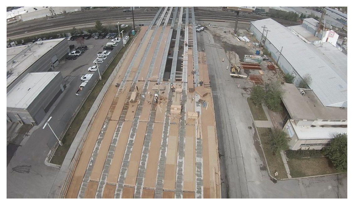
Aerial view of the project