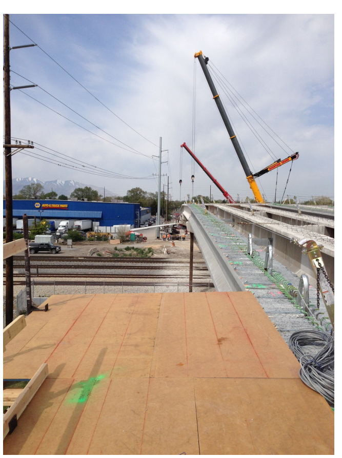
Forming the overhang