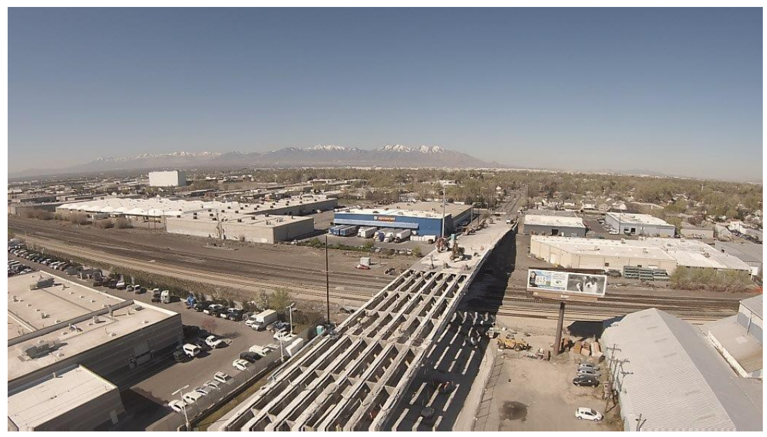
Aerial view of the project