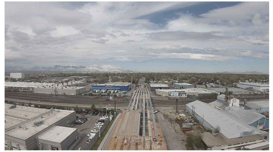
Aerial view of the project