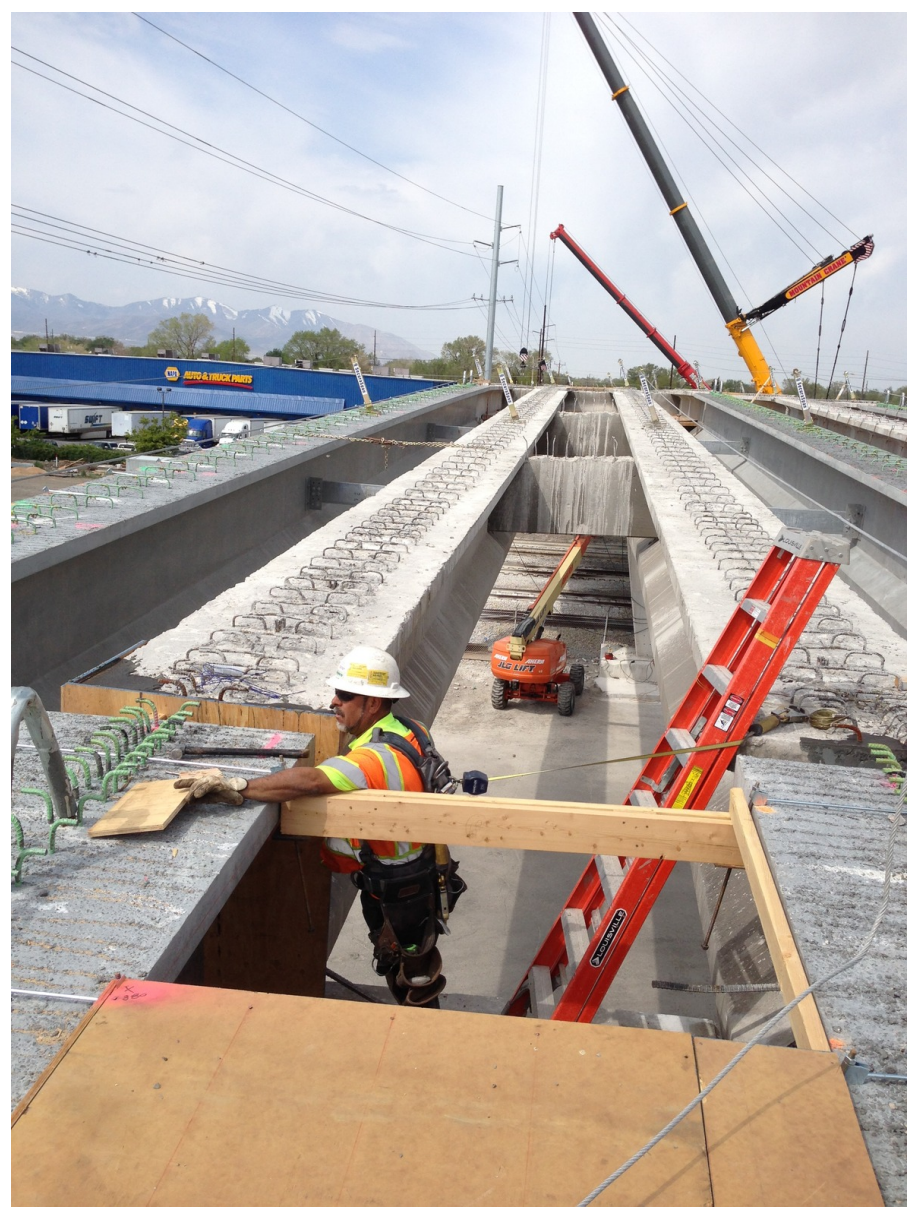
Forming the bridge deck