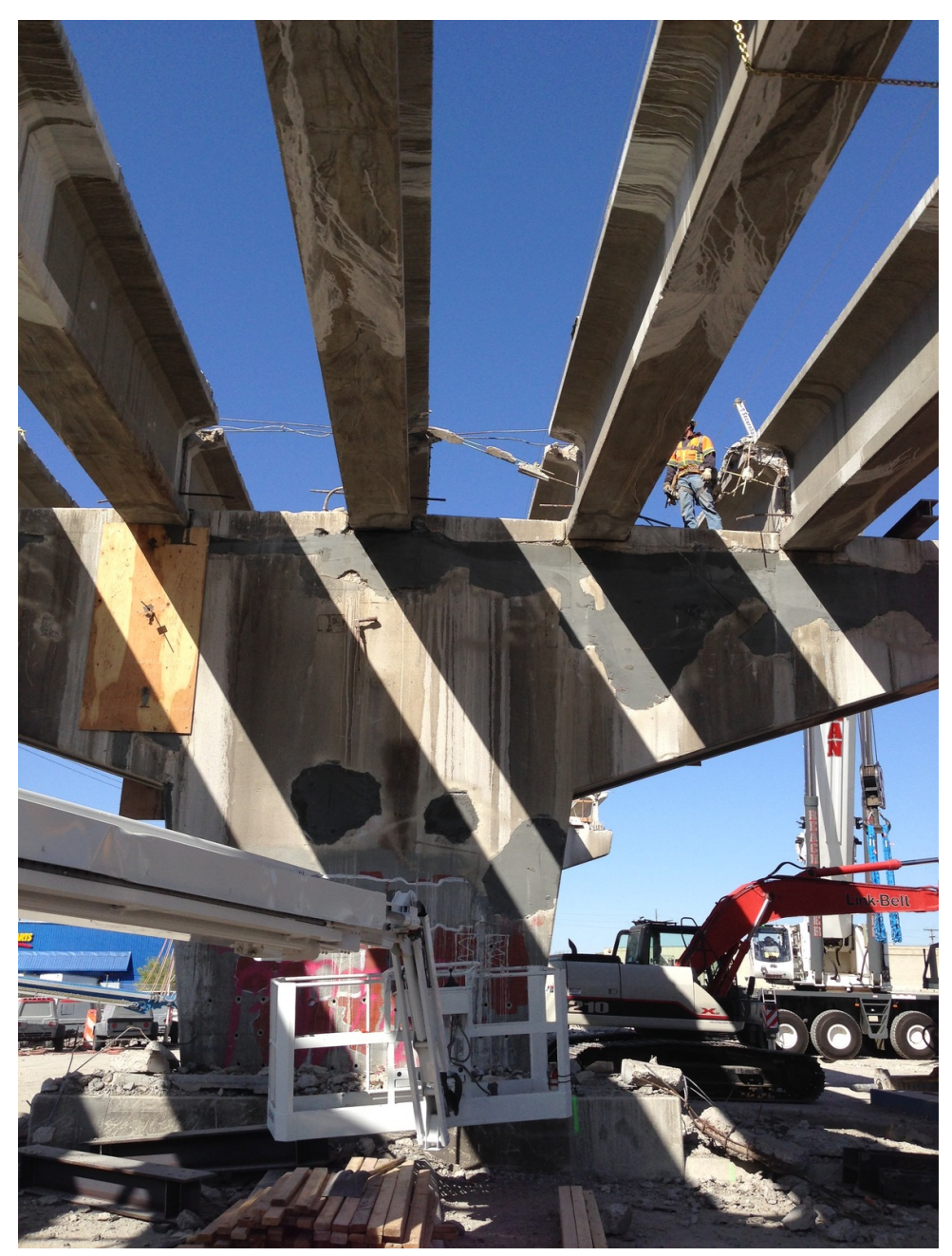
Repair work on the columns