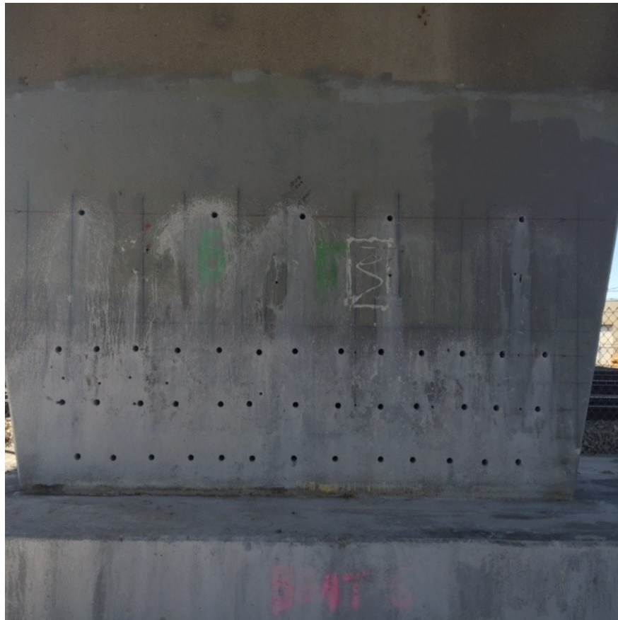
Holes drilled through the column