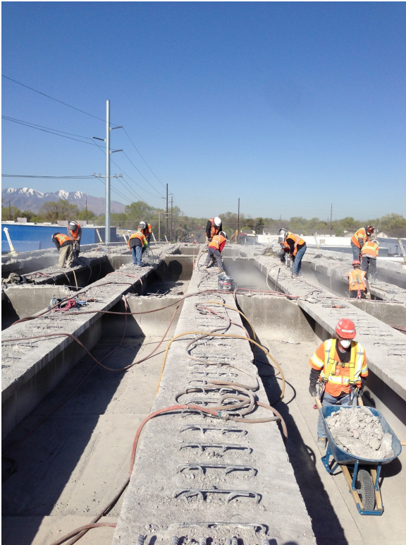
Crews working above the false bridge deck over the railroad tracks