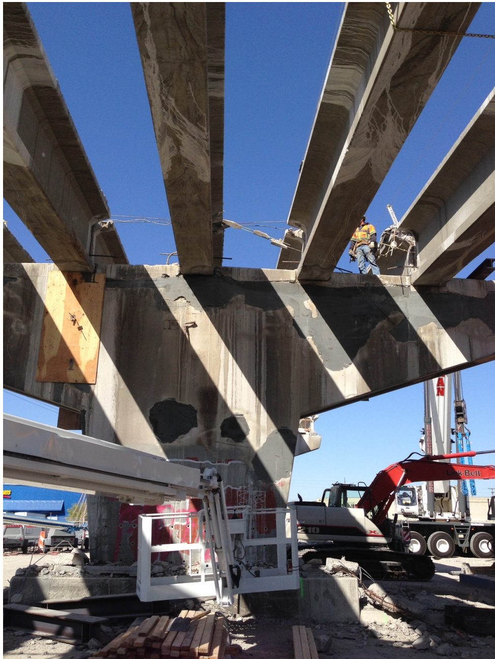
Repair work on the columns