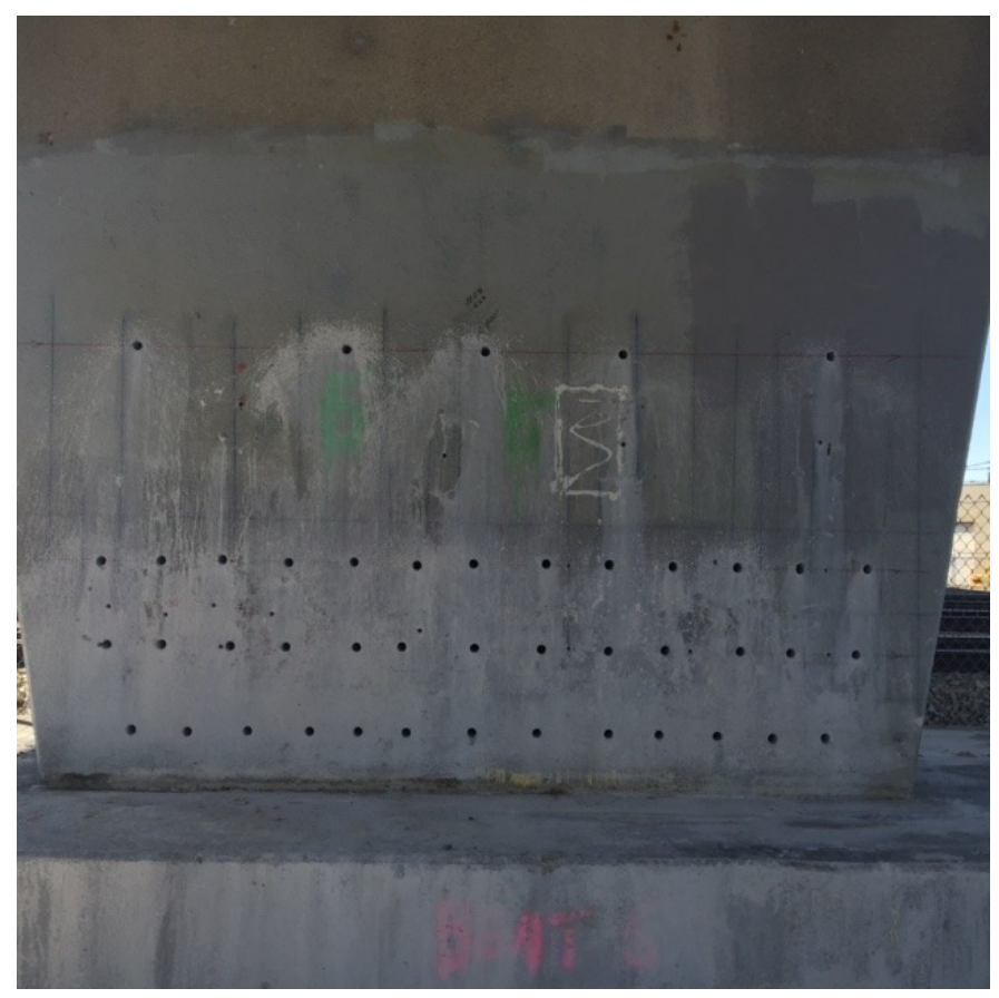
Holes drilled through the column