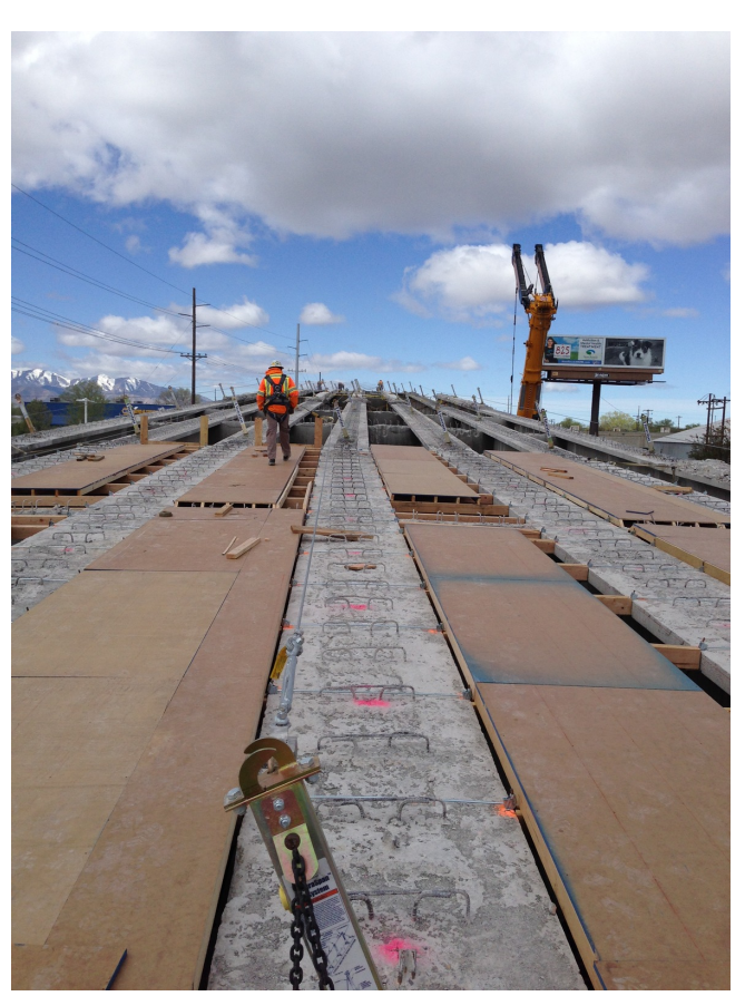
Forming the bridge deck