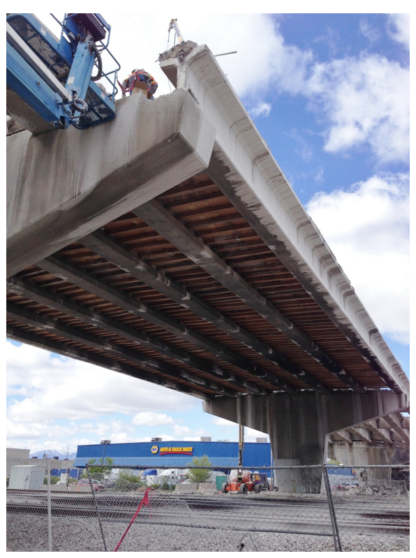
False bridge deck over the railroad tracks